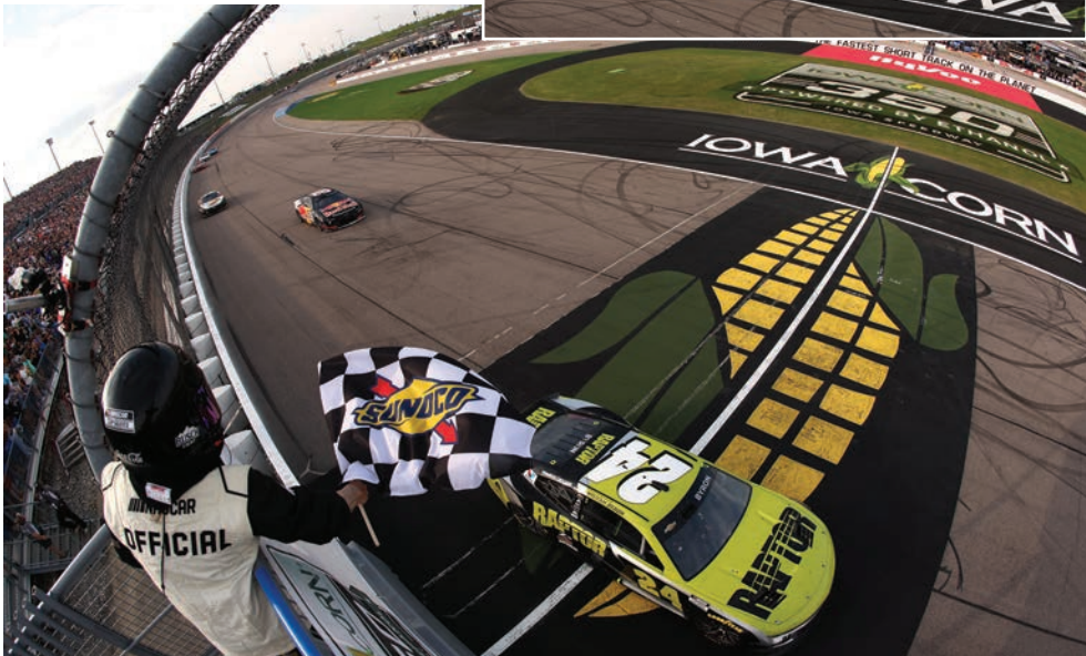
William Byron, driver of the #24 Raptor Chevrolet, takes the checkered flag to win the Cup Series Iowa Corn 350 Powered by Ethanol at Iowa Speedway on Sunday.

With his first victory at the 0.875-mile short track and the 15th of his career, William Byron regained the series lead by 18 points over teammate Chase Elliott, who finished 14th.