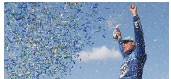
Kevin Harvick set the Cup lap speed record at Michigan in 2018.