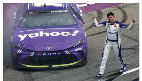
Denny Hamlin in Victory Lane after winning last year's FireKeepers 400.