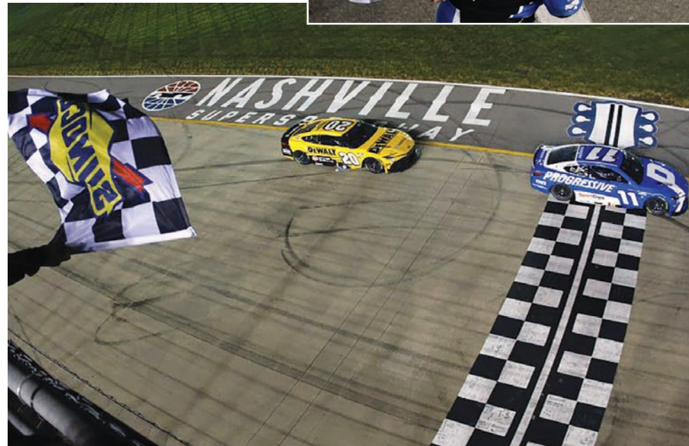
Denny Hamlin prevails Sunday at Nashville, claiming his second win of the 2026 season. He then honored his longtime Joe Gibbs Racing teammate, Kyle Busch, with a showman's bow (top).