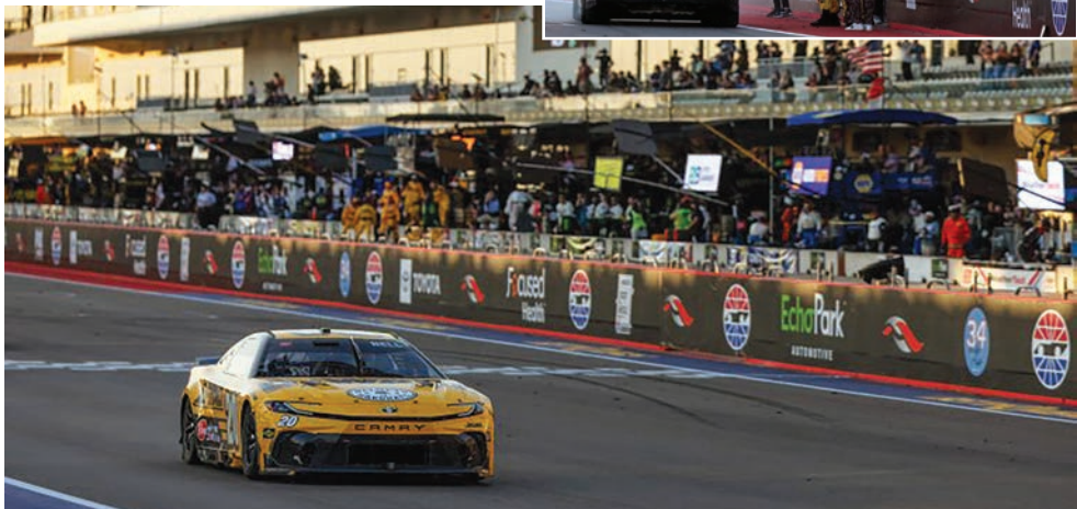
Christopher Bell, driver of the #20 DEWALT Toyota, crosses the finish line for his second consecutive Cup Series victory in Sunday's EchoPark Automotive Grand Prix in Austin, Texas.

After passing Kyle Busch for the lead and staving off defending race winner William Byron over the last five laps, Christopher Bell was a back-to-back winner in the Cup Series for the first time in his career.