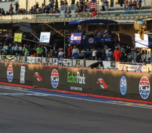
Christopher Bell, driver of the #20 DEWALT Toyota, crosses the finish line for his second consecutive Cup Series victory in Sunday's EchoPark Automotive Grand Prix in Austin, Texas.

and Kyle was just kind of sitting there waiting for one of them to bobble or slide their tires. Bell got by him. I felt like once he got clear, his car was super loose, and it kind of gave me a couple of shots at him, and I just couldn't ever get beside him.