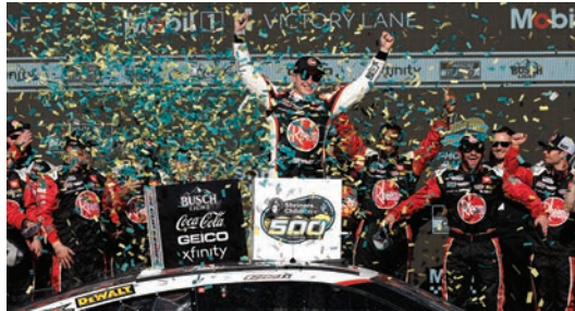
Christopher Bell rang-up the W last year at Phoenix.

APRIL 21, 2007 - Jeff Gordon opens the 20th season of Cup action at Phoenix with a victory over Tony Stewart in the SUBWAY Fresh Fit 500. The victory is Gordon's first in 17 tries in the desert and the first by a driver from the pole position. It is Gordon's 76th win, tying him for sixth all-time with Dale Earnhardt on the Cup Series career wins list. Gordon celebrated by holding a "3" flag out of driver's side window to commemorate the late Earnhardt's great career.