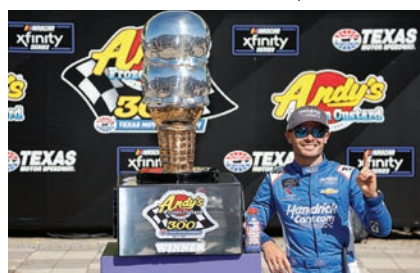
WINNER: KYLE LARSON

• Saturday's ANDY'S FROZEN CUSTARD 300, Texas Motor Speedway