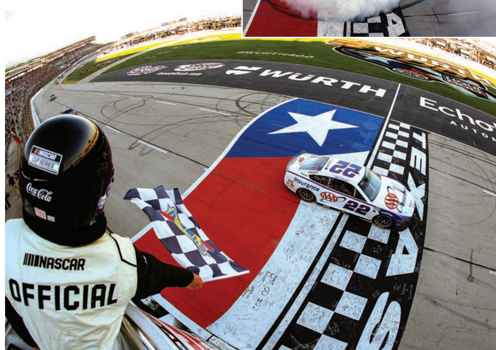
Joey Logano, driver of the #22 AAA Insurance Ford, takes the checkered flag to win the Cup Series Würth 400 at Texas Motor Speedway on Sunday.

Joey Logano beat runner-up Ross Chastain to the finish line by 0.346-second in overtime to score his second victory at 1.5-mile Texas Motor Speedway and the 37th of his career.