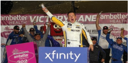
WINNER: AJ ALLMENDINGER

• Saturday's AMBETTER HEALTH 302, Las Vegas Motor Speedway