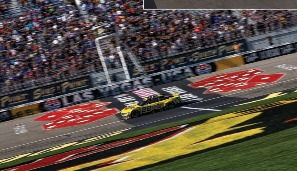
Joey Logano, driver of the #22 Pennzoil Ford, crosses the finish line to win the Cup Series South Point 400 at Las Vegas Motor Speedway on Sunday.