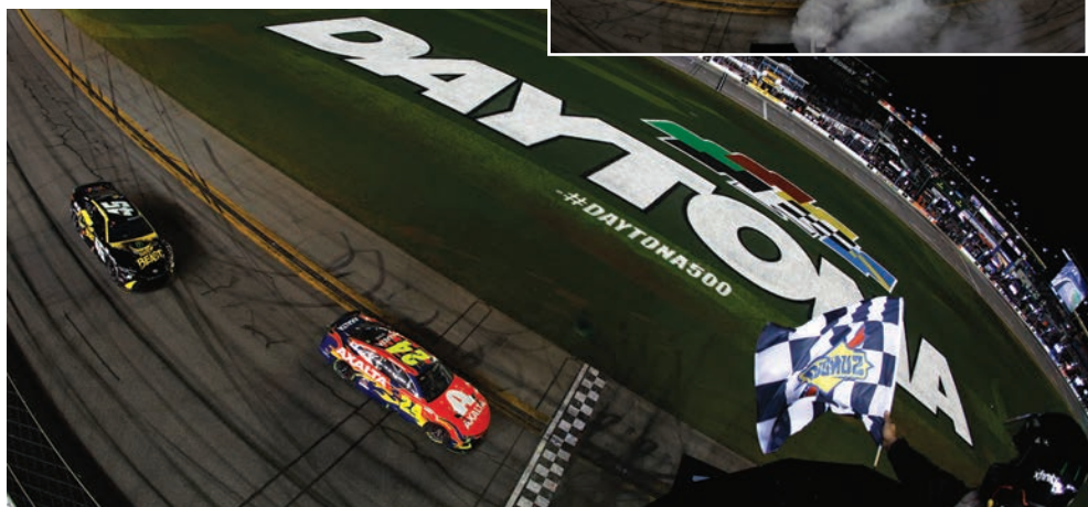
William Byron, driver of the #24 Axalta Chevrolet takes the checkered flag to win the Cup Series Daytona 500 at Daytona International Speedway on Sunday.

William Byron crossed the finish line 0.113 seconds ahead of runner-up Tyler Reddick in overtime, becoming the first driver since Denny Hamlin in 2019-20 to win the Great American Race in consecutive years.