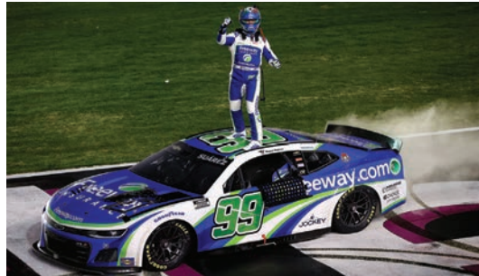
Daniel Suarez partied topside after winning last year at Atlanta.

Atlanta Motor Speedway has undergone massive expansion and dramatically increased its menu, hosting everything from the Xfinity and Truck Series, drag racing, legends and Bandolero Racing as well as car shows, concerts and business conventions.