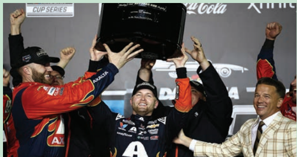
William Byron in Victory Lane Sunday at Daytona.

"Just obviously fortunate that it worked out in our favor. But just really proud of this team. Worked super hard all week and had an amazing car. Just had a really hard time with the fuel saving and kind of staying towards the front. Crazy. I can't honestly believe that. But we're here. So proud of it." - William Byron, who emerged from late chaos to take Sunday's rain-delayed Daytona 500