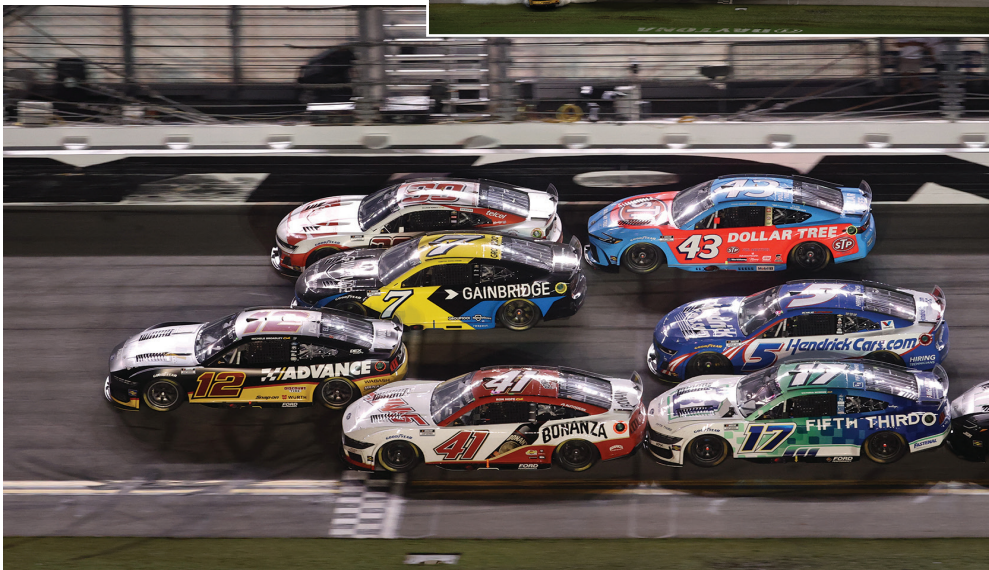
Ryan Blaney, driver of the #12 Advance Auto Parts Ford, crosses the finish line to win the Cup Series Coke Zero Sugar 400 at Daytona International Speedway on Saturday.

Ryan Blaney's second win of the season, his second at Daytona and 15th of his career vaulted the driver of the No. 12 Team Penske Ford into second place in the regular-season standings, earning him a bonus of 10 Playoff points.