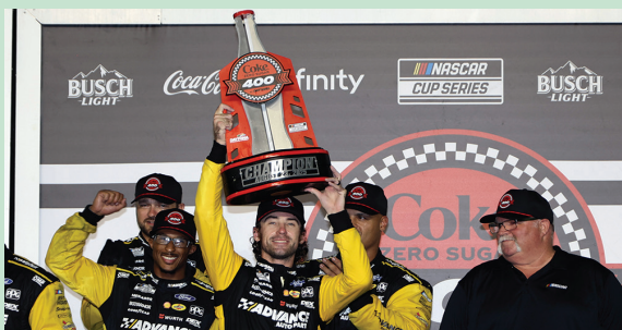
Ryan Blaney celebrates in Victory Lane after winning at Daytona Saturday.

— Ryan Blaney, who grabbed his second win of the season Saturday at Daytona