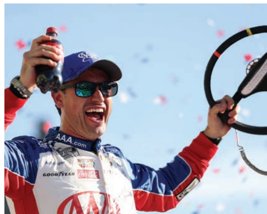
Joey Logano won last May's race at Texas.