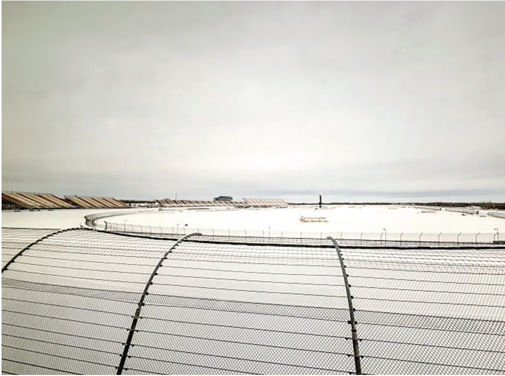
Michigan International Speedway