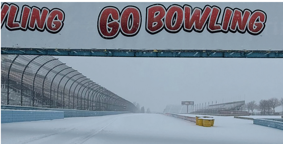
Watkins Glen (NY) International

Winter season is here, and that means some of NASCAR’s venues are bound to have snowy weather. Here’s a look at some cold courses.