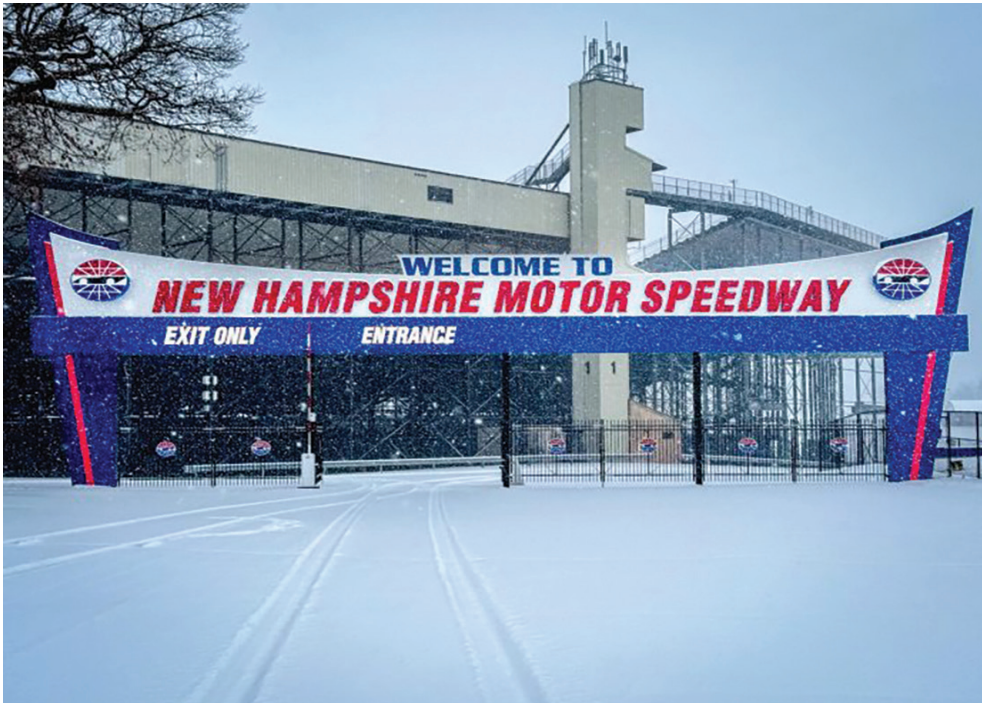
New Hampshire Motor Speedway