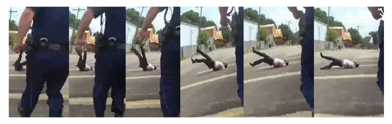
A handcuffed man with no way to break his fall slams into the pavement after being tased.

In another incident, an LSP trooper tased an unarmed man after pulling him over for not signaling while changing lanes, not wearing a seatbelt, and having a fake vehicle inspection sticker. The man was handcuffed and shoeless at the time. After pulling up a picture of the person to whom the car was registered, the troopers became suspicious as they did not believe the driver resembled the owner of the vehicle. When asked, the driver did not produce a driver's license and hesitated when providing his date of birth. Before he could finish answering the trooper's question, troopers grabbed the man, handcuffed, and searched him. As the troopers were walking the man to a patrol car, he attempted to run. All three troopers who were on the scene chased after him. Within six seconds, a trooper tased the man. Unable to break his fall, he fell backwards onto the pavement, hitting his head and back and cutting his elbow so severely he needed stitches.