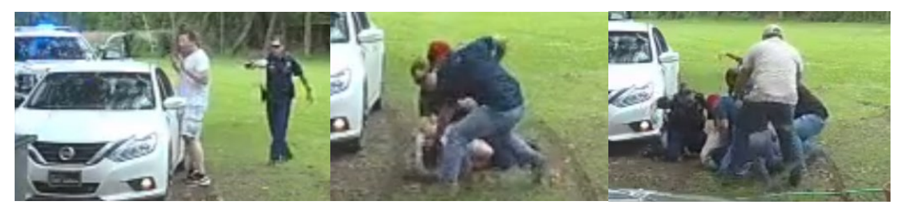
Following a pursuit, LSP tased a man in the back while he was facing a car with his hands up. Five troopers piled on him and punched him repeatedly. When placing the man in a patrol car, a trooper told him, "You're a piece of shit. You're a first-rate piece of fucking shit."

For example, troopers tased a man in the back while he was standing with his hands in the air and then beat him with their fists, apparently in retaliation for attempting to evade capture. Four days before the incident, a female trooper had tried to arrest the man during a traffic stop, but he fled and escaped. When troopers later went to the man's home with an arrest warrant, he again fled in his vehicle. When the vehicle finally stopped in a residential yard, the man got out of the car and turned to face it with his hands up. An LSP trooper tased him in the back. Five troopers, including some in plain clothes, then pinned him down, tasing him and punching him more than 20 times in his head and body, even though he was restrained, unarmed, and did not appear to be resisting. One of the troopers grabbed the man's head and slammed it into the ground. Another trooper held his head down in the dirt for approximately 20 seconds. After the many uses of force, when placing the man in a patrol car, a trooper told him, "You're a piece of shit. You're a first-rate piece of fucking shit . . . You want to try to run and fight a fucking girl."