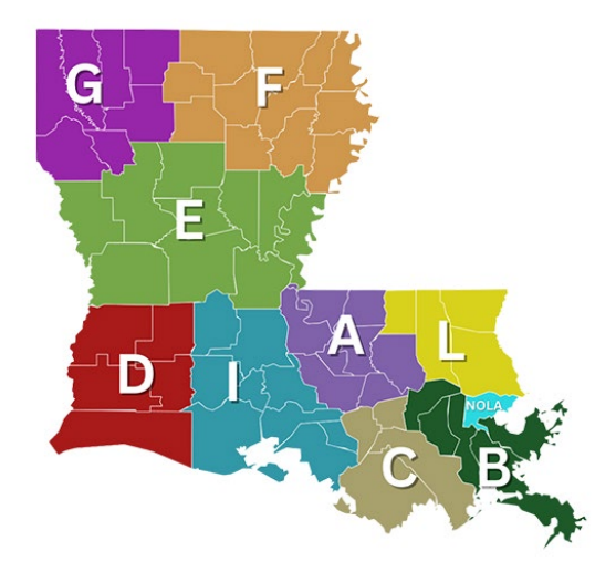
LSP has ten troops that patrol different parishes around the state.

LSP also has several statewide units. The Criminal Investigations Division (CID) investigates crimes around the state. The Force Investigation Unit (FIU) investigates serious uses of force by LSP troopers. LSP's Internal Affairs (IA) unit is responsible for investigating potential policy violations by troopers and civilian law enforcement professionals.