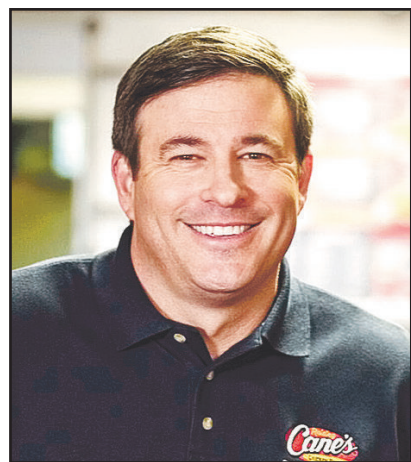
TODD GRAVES FOUNDER, CEO FRY COOK & CASHIER Raising Cane's Chicken Fingers

2022 was another great year for Raising Cane's as we served our customers 330 million times and partnered with over 33,000 local organizations as we gave back $25M to our local communities. We grew to over 675 restaurants, across 35 states – including opening our first restaurants in Pennsylvania, Michigan, and Florida. Along with all that growth came endless opportunity for our Crewmembers. In 2022 alone, we created over 13,000 new jobs and promoted over 1,500 Crewmembers internally. I am proud that this year we were recognized by Forbes as a top employer for Diversity, New Grads, and Women, as well as being named a top brand to work for in our industry by QSR Magazine.