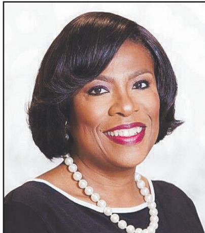
SHARON WESTON BROOME MAYOR-PRESIDENT City of Baton Rouge East Baton Rouge Parish

Meanwhile, national and international corporations continue to announce major economic development projects that leverage Louisiana's unique business advantages. Total capital investments have exceeded $10 billion in each of the last three years. Since 2016, more than 350 economic development projects have launched, representing nearly $90 billion in investment and more than 70,000 jobs. Sustaining that momentum in 2023 is our priority as we work for the prosperity of our state and its people.