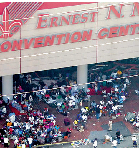
The convention center was a shelter of last resort during Hurricane Katrina.

WHAT HAPPENED The city's convention center opened for convention business in January 1985.