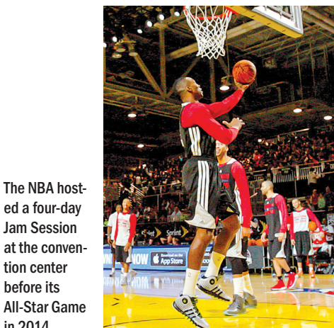
The NBA hosted a four-day Jam Session at the convention center before its All-Star Game in 2014.