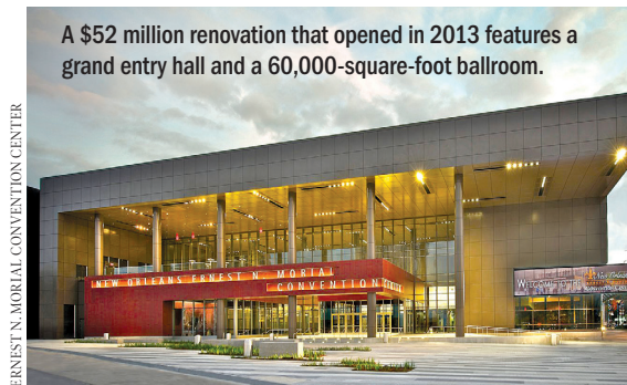
ERNEST N. MORIAL CONVENTION CENTER

Planning for the center began in 1978, just 10 years after the city's first convention center, Rivergate opened. The new