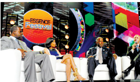
The Essence Festival holds a conference and expo at the conference center during its annual event.

center was built along the riverfront to accommodate the 1984 World's Fair. It opened as a convention center in 1985. A second phase was opened in 1991, doubling the size of the center. The next year, it was named for former Mayor Ernest N. Morial, who pushed for the center. A third phase was opened in 1999 as attendance kept reaching new heights and demand for the center's space mounted.