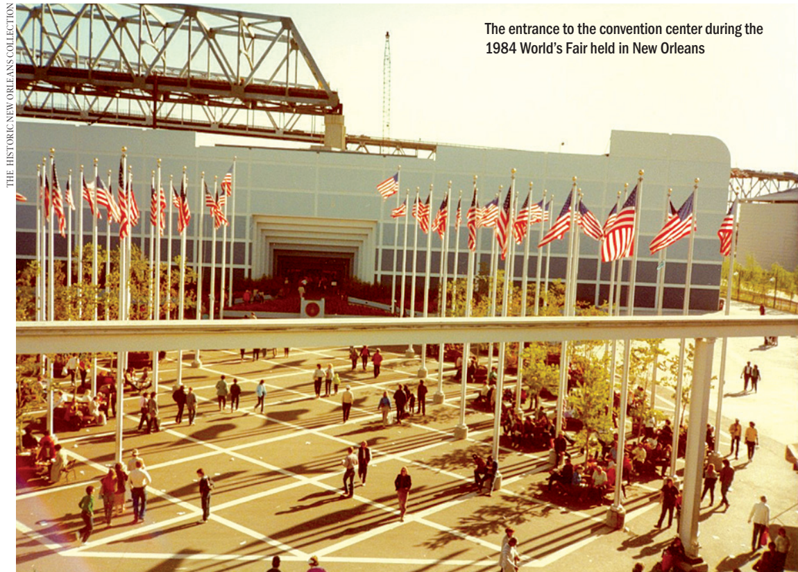
THE HISTORIC NEW ORLEANS COLLECTION

The center has planned a new expansion, including more riverfront development, to open in 2018, but those plans have been slow to get off the ground.