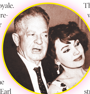
Earl Long with Blaze Starr at the Sho-Bar

Burlesque made a comeback in the late 1990s as more of an art form than a club act. There is a burlesque show almost every night in the city, and the city hosts an annual burlesque festival.