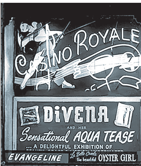
Evangeline the Oyster Girl took an ax to Divena's tank at Casino Royale because she considered her competition.