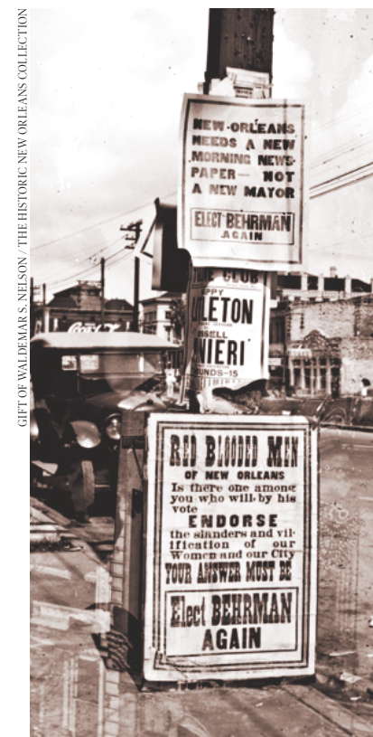
1920 re-election signs were erected for Martin Behrman, who was defeated by reform candidate Andrew McShane. Behrman retook the mayor’s office in 1925.