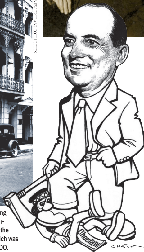
A caricature drawing of Mayor Chep Morrison taking down the Choctaw Club, which was the home of the RDO.