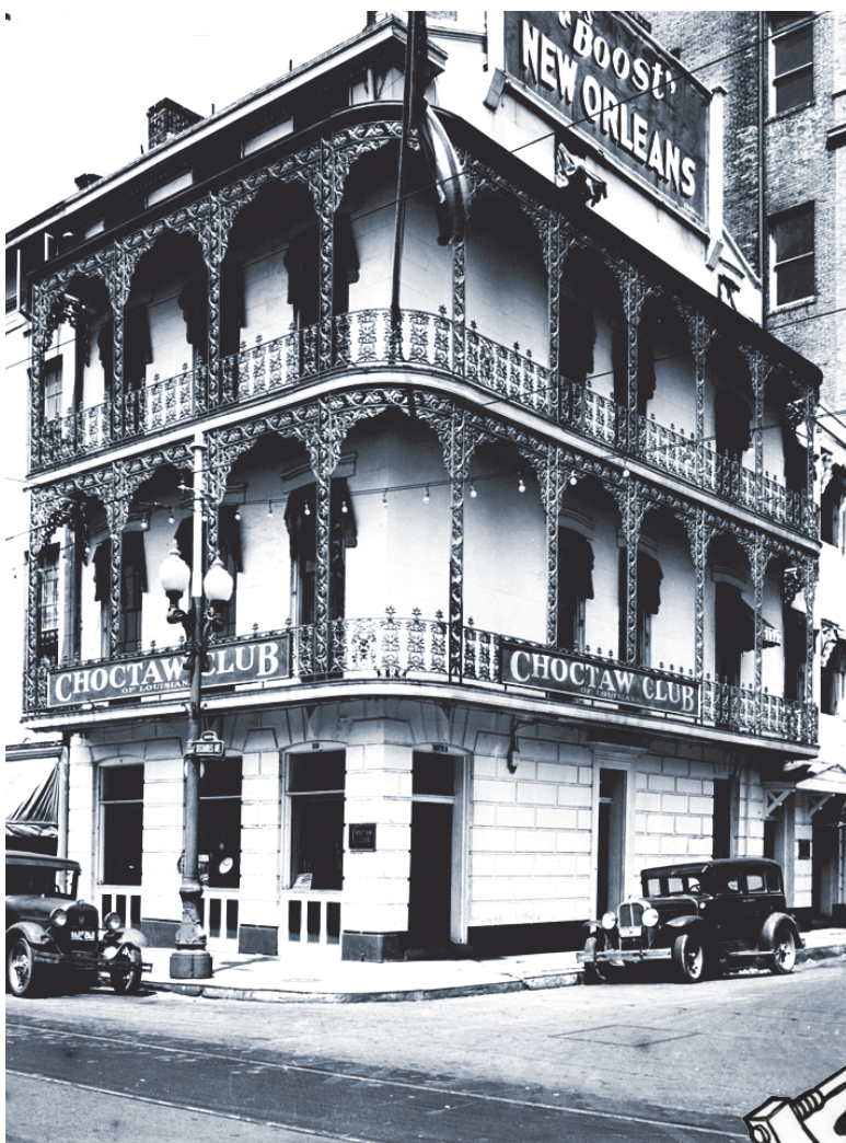
The Choctaw Club, at 518 St. Charles Ave., was the home to the RDO. It was located on Carondelet Street and then Canal Street before moving to this building, which has been since torn down for a hotel.