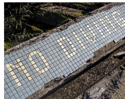
A remnant of a swimming pool at Lincoln Beach.

Lincoln Beach booked popular local and national musicians including Fats Domino and Ike and Tina Turner.