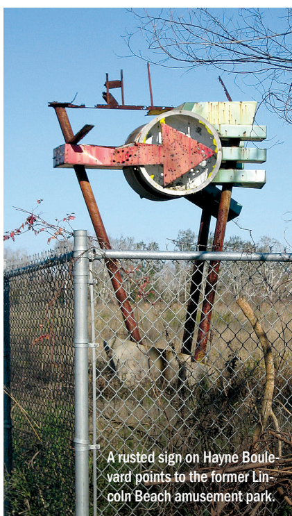
A rusted sign on Hayne Boulevard points to the former Lincoln Beach amusement park.

A revamped Lincoln Beach, with roller coasters and other rides, between 1954 and 1964,