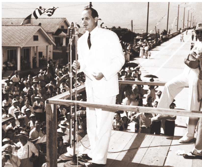
Chep Morrison speaks at the dedication of the Franklin overpass in 1955.

Association. Morrison brought home rule to New Orleans and established a strong-mayor form of government. He was responsible for modernist buildings in the city, including City Hall, the Union Passenger Terminal and the main branch of the library. During his tenure, the city reached an all-time peak population of 630,000. He also revamped many city services, including the recreation department, and was mayor during construction of a portion of Interstate 10. Morrison made three unsuccessful runs for governor. In 1959, Morrison's wife died unexpectedly. He became known as a playboy, even for a time dating Zsa Zsa Gabor. In 1961, President John F. Kennedy named Morrison ambassador for the Organization of American States. In 1964, Morrison was on plane to Mexico when it crashed near Ciudad Victoria, Mexico. Thousands streamed into Gallier Hall to pay their last respects to Morrison.