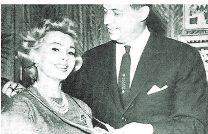
Chep Morrison dated actress Zsa Zsa Gabor after his wife's death in 1959.