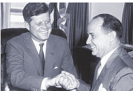
President John F. Kennedy meets with Chep Morrison in the Oval Office in 1961. Kennedy designated him to serve as an ambassador to the Organization of American States.