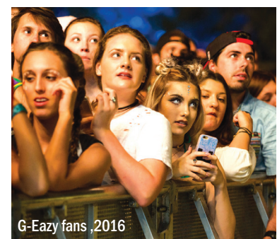
G-Eazy fans, 2016

The first Voodoo, put on by Rehage Entertainment, featured Moby and Wycleaf Jean at one-day festival in Tad Gormley Stadium in City Park. It attracted about 20,000 people. The crowd tripled the next year, when the festival was moved to a grassy area of City Park, became a two-day festival and featured rapper Eminem.