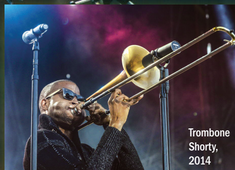
Trombone Shorty, 2014