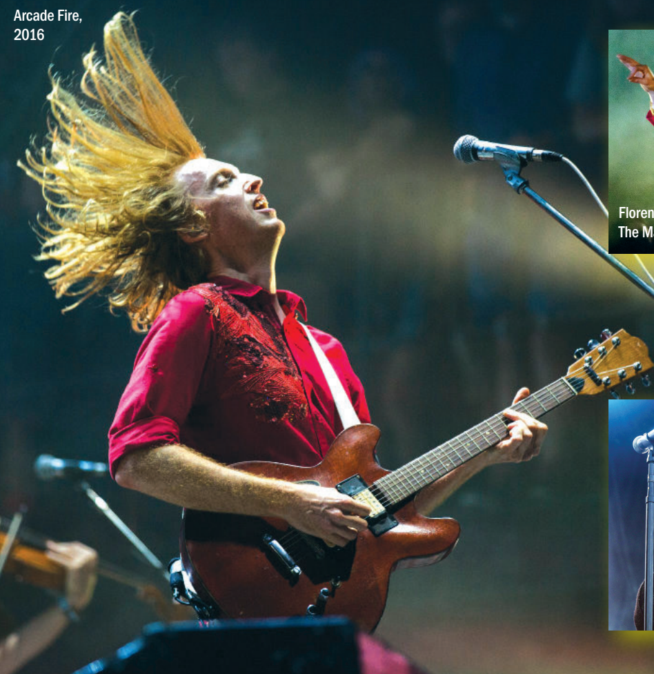
Arcade Fire, 2016

Voodoo Festival — birthed in 1999 as a small festival with even smaller crowds — has become one of the must-be-at festivals every year at Halloween.