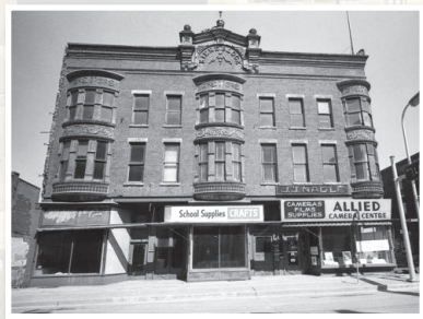
7 J.J. Nagle building (Allied) 4th and Main streets