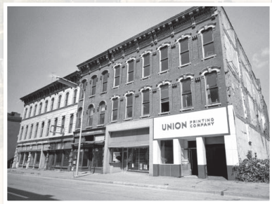
6 Hoermann Press/Union Printing 400 block of Main street