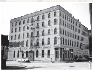
18 Stampfer's Farm & Home 7th and Iowa streets