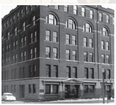
12 H.B. Glover Co. 480-498 Iowa St.