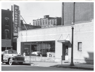
16 M.P. Hogan Insurance 715 Central Ave.

To see photos and locations of additional buildings that were razed during urban renewal, go to TelegraphHerald.com