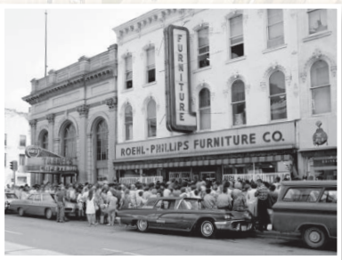
13 Tranel's Cafe/Roehl-Phillips 6th and Main streets