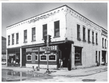
14 Grand Tap 802 Iowa St.