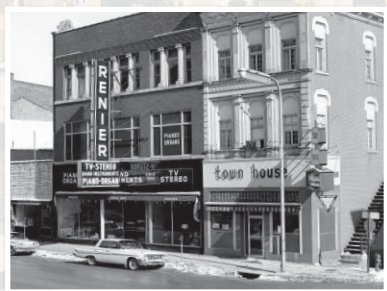
5 Renier's/Town House 5th and Main streets