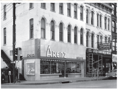
8 Arenz/Graham Mens Wear 9th and Main streets