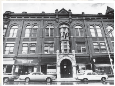
1 Lincoln Building (Bayless) 8th and Locust streets