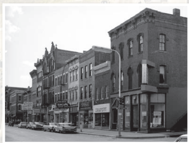
2 Capri/Gambles/Ken Hayes 500 block of Main Street