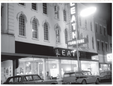
10 Leath Furniture 656 Main St.