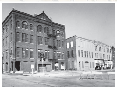
20 Universal Elect./Ridge Motor 400 block of Iowa Street