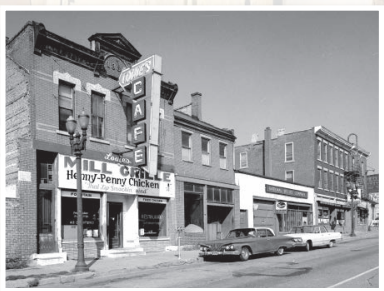
17 Louie's Cafe/National Biscuit 600 block of Central Avenue