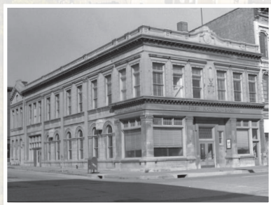
3 First National Bank building 503 Main St.