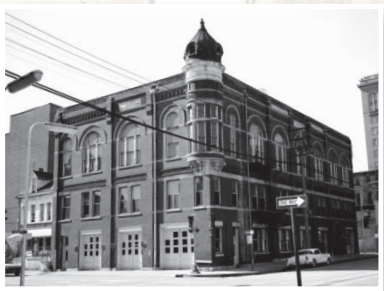
11 Central Engine House 9th and Iowa streets