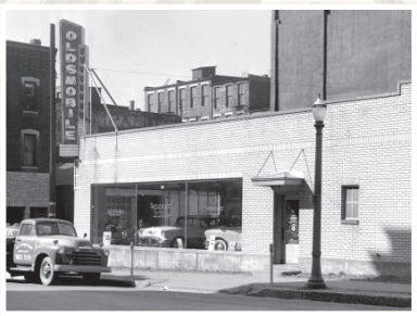
19 Clemen's Motor Sales 501 Iowa St.