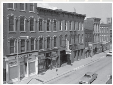
4 Knippel's/Navy Club/Demetri's 400 block of Main Street