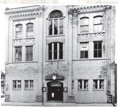
9 Boys Club 898 Iowa St.