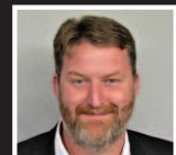
GW Hill Realtor 276-233-6655

3-bed, 2-bath home features hardwood flooring throughout, a detached efficiency apartment, and detached 3-car garage with one oversized bay.