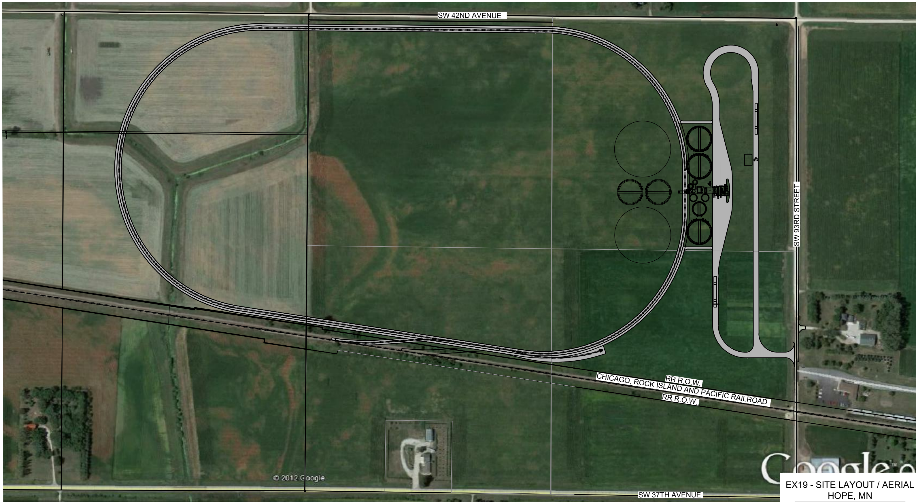
EX19 - SITE LAYOUT / AERIAL HOPE, MN