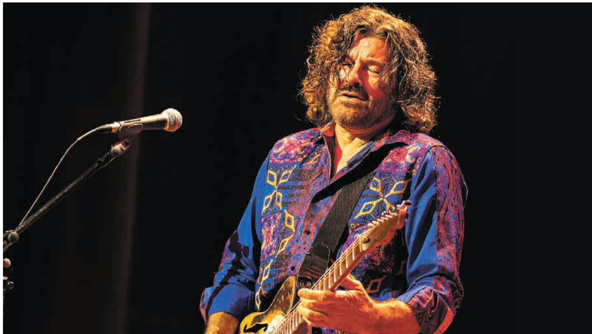
In 1992, veteran Delta blues artist Tab Benoit released his first recording, Nice and Warm , on the Justice Label. In 2024, he released I Hear Thunder , his first studio album in 13 years, on his Whiskey Bayou Records label. As part of their Soul of Swamp Tour 2026, Benoit and his band play Albuquerque's KiMo Theatre on May 28 then head to Tumbleroot Alegría on May 30.

Intergenerational exhibition of 100-plus artworks by 40-plus artists and collectives with Native American, Alaska Native, First Nations, Métis, and Inuit backgrounds; opening June 5.