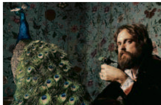
Iron & Wine performs Sept. 30 at the Lentic.