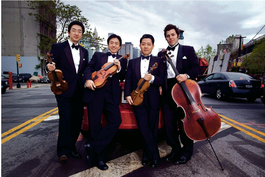
Taos School of Music presents the Shanghai Quartet July 18.