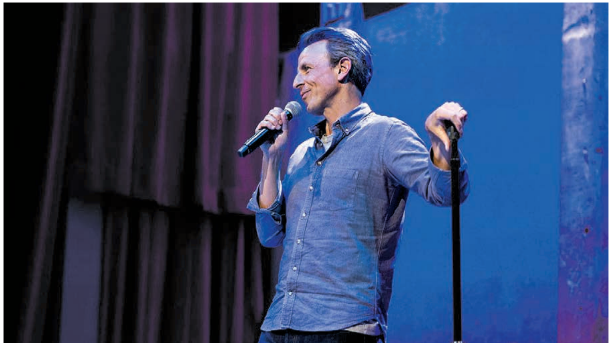
Seth Meyers, Emmy Award-winning writer, New York Times bestselling author, and host of NBC's Late Night with Seth Meyers for over 10 years, stops by Route 66 Casino in Albuquerque May 9 on his stand-up comedy tour.

Delta blues singer-songwriter on his Soul of Swamp Tour 2026; 7:30 p.m. May 28 (Albuquerque), $34-$55; 7:30 p.m. May 30 (Santa Fe), $51 in advance, $56 day of show.