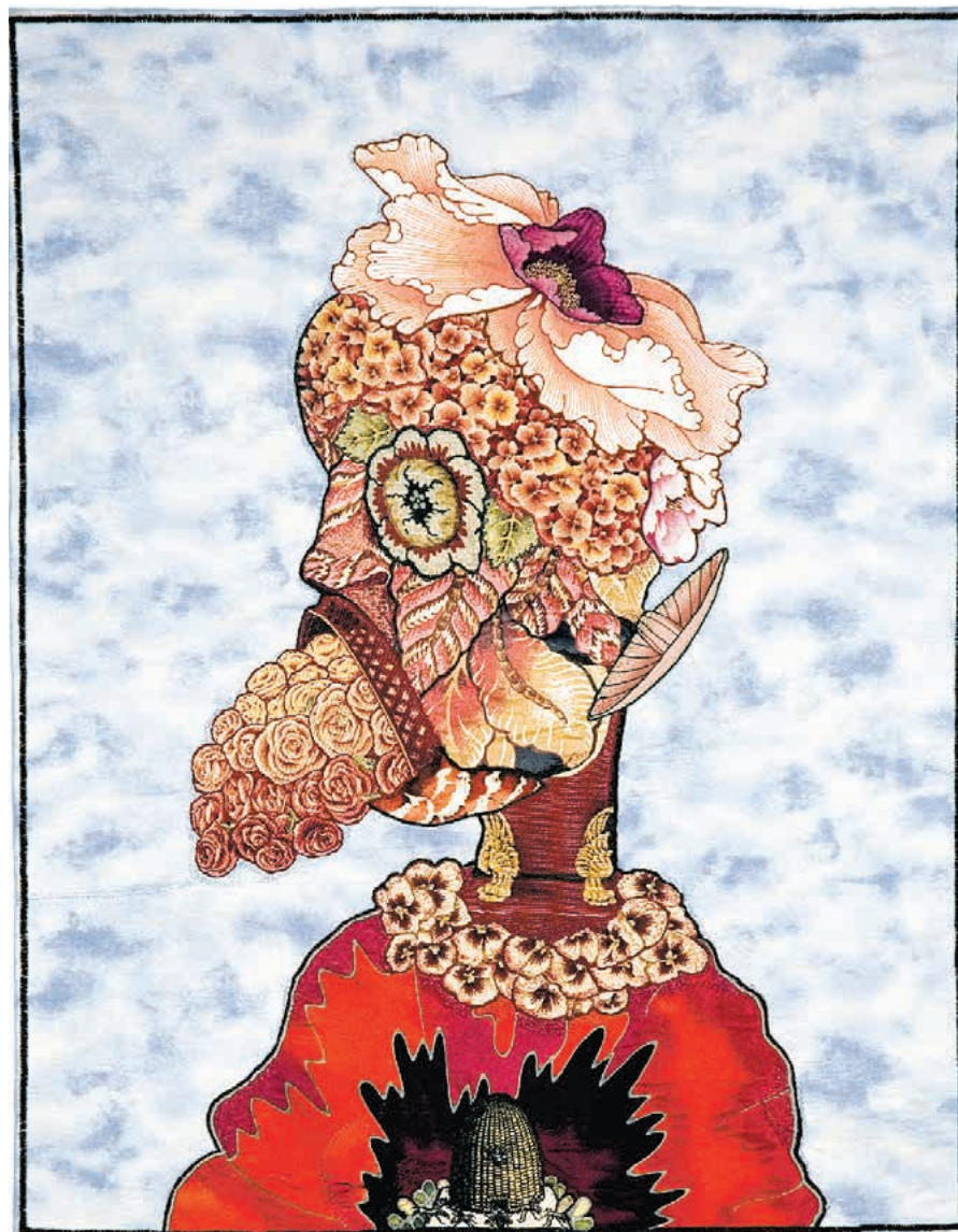
The Lucid Perturbations exhibit at Zane Bennett Contemporary Arts includes 200 examples from China Marks' sewn body of work, which includes over 600 large collaged tapestries, broadsides of embroidered text, small and medium-sized drawings; plus, a small library of sewn books from the last 23 years of her artistic career. Marks' exhibit is on view through July 11. Above, Florabundum

217 Johnson Street, 505-946-1000; okeeffemuseum.org; access-ok.gokm.org A Circle that Nothing Can Break , O'Keeffe paintings; through June 1 • Tewa Nangeh/Tewa Country , contemporary works by artists, scholars, and culture bearers from the six Tewa Pueblos of Northern New Mexico; through September 7.