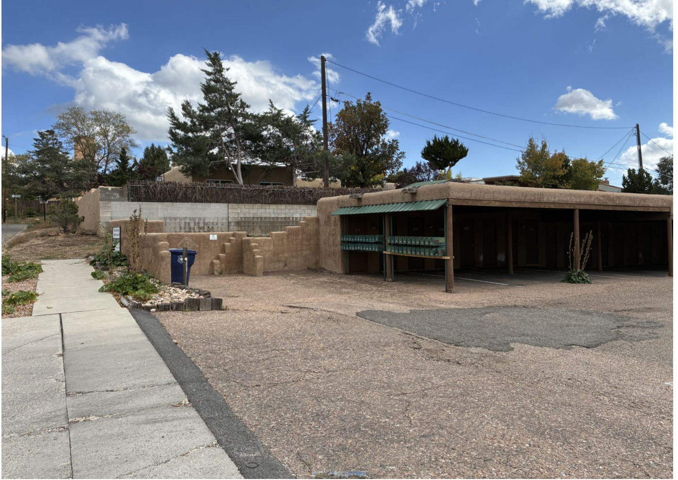
Looking east on Camino de Marquez at the public sidewalk and the existing covered parking.