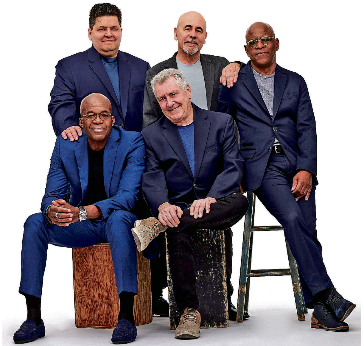
Emerging from the fusion era, Spyro Gyra broke through in the mid-'70s, combining R&B and elements of pop and Caribbean music with jazz. The quintet brings its smooth-jazz arrangements to Albuquerque's KiMo Theatre April 12.

Route 66 Casino, Albuquerque; pattilabelle.com Celebrating six decades of hits; 8 p.m. June 12; $47-$182.