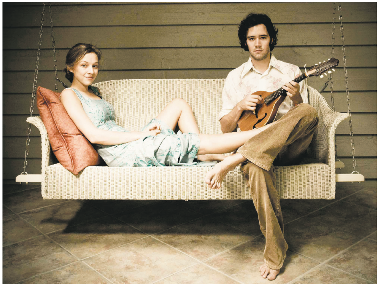
AMP Concerts presents Watchhouse April 27 at the Lensic.