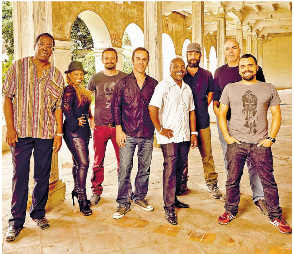
Back on the road after their 20th-anniversary tour in 2025, the Lima, Peru-based band Novalima continues its bouncy blend of electronic beats, dub-reggae, and cumbia-infused Afro-Peruvian music on May 3 at The Bridge at Santa Fe Brewing.