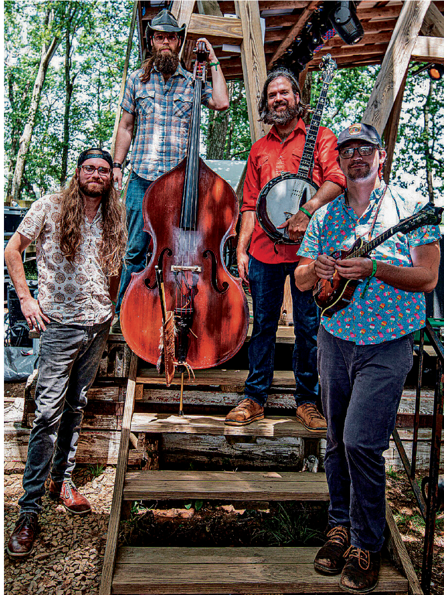
Ozark-inspired newgrass band Arkansauce performs at Tumbleroot Alegria on Thursday.

Tri-M Productions presents Jason Robert Brown's time-bending musical exploring love and loss; 7 p.m.; 2 p.m. Saturday and Sunday; $20-$56.