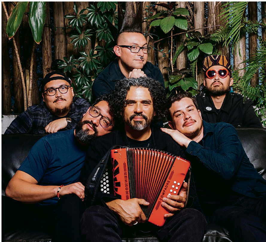
Taos-based DALEEE KTAOS' Lat'in Go Parties features Tex-Mex music by Frontera Bugalú on Friday.

TerraCotta Wine Bistro; terracottawinebistro.info Classical guitarist; 6:30-8 p.m. Mondays; no cover.