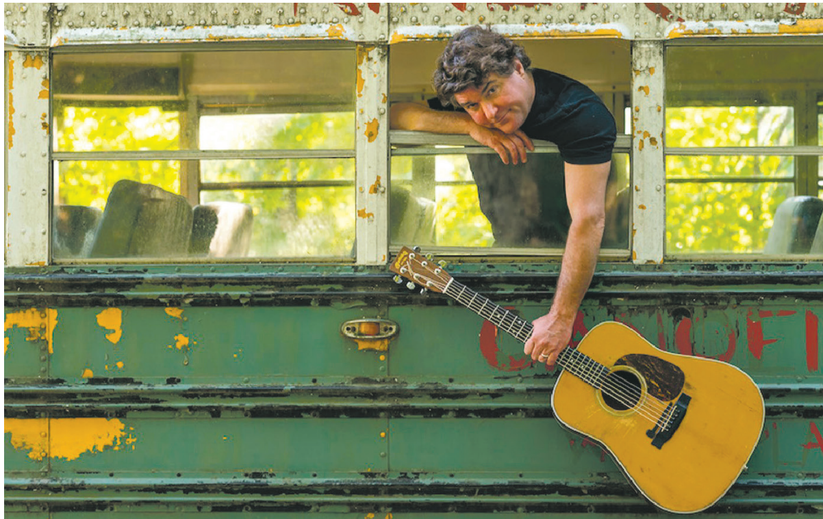
Meow Wolf presents Keller Williams March 11.