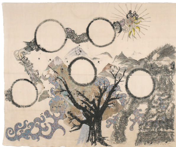
Bjorn Amelan: #14 2016, Sumi and colored inks on late 18th/early-19th century linen

Peters Projects, 1011 Paseo de Peralta, 505-954-5800