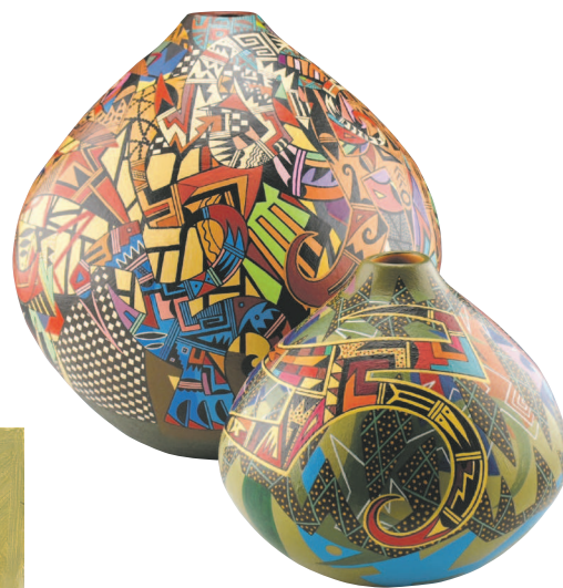
Les Namingha: Urban Polychrome Pots 2018, acrylic on clay

King Galleries, 130-D Lincoln Ave., 480-440-3912