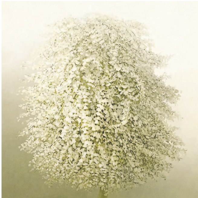
Irene Kung: Ginkgo Tree 2018, pigment print on rag paper

Chiaroscuro Contemporary Art, 558 Canyon Road, 505-992-0711