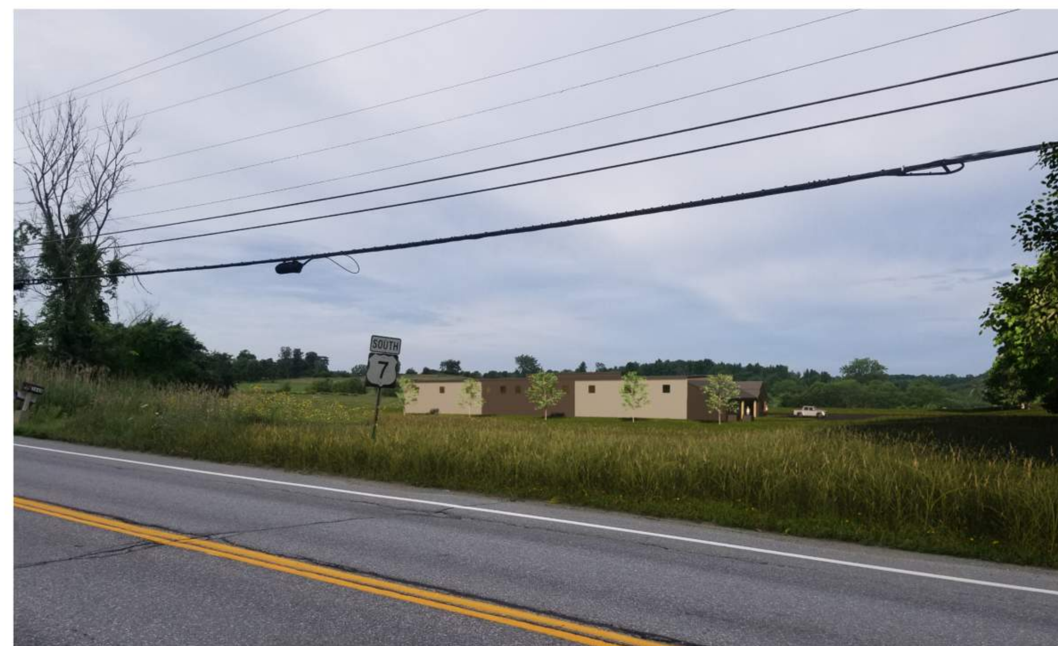
3: RT 7 - LOOKING SW