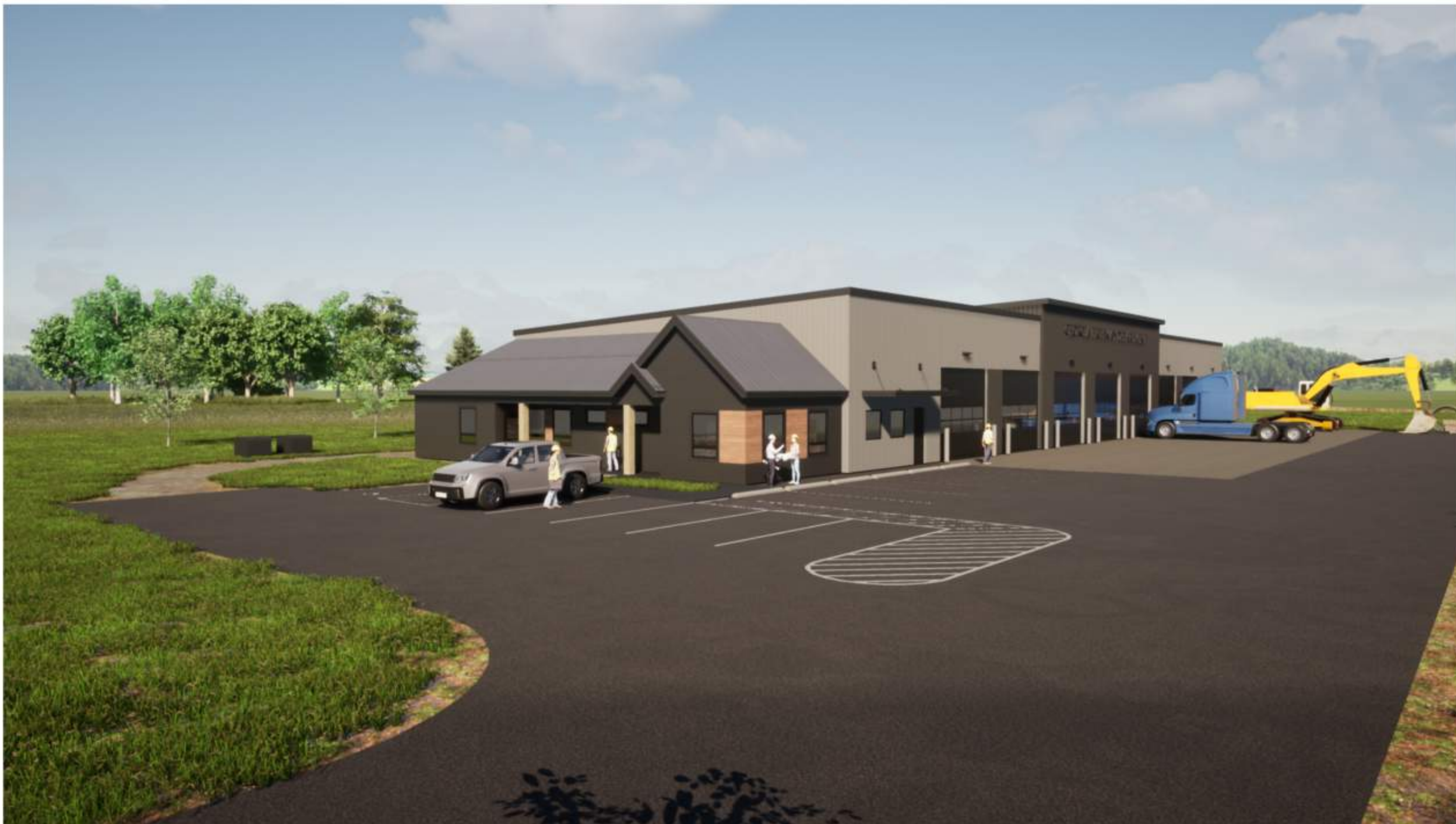
2: ENTRY - LOOKING SE