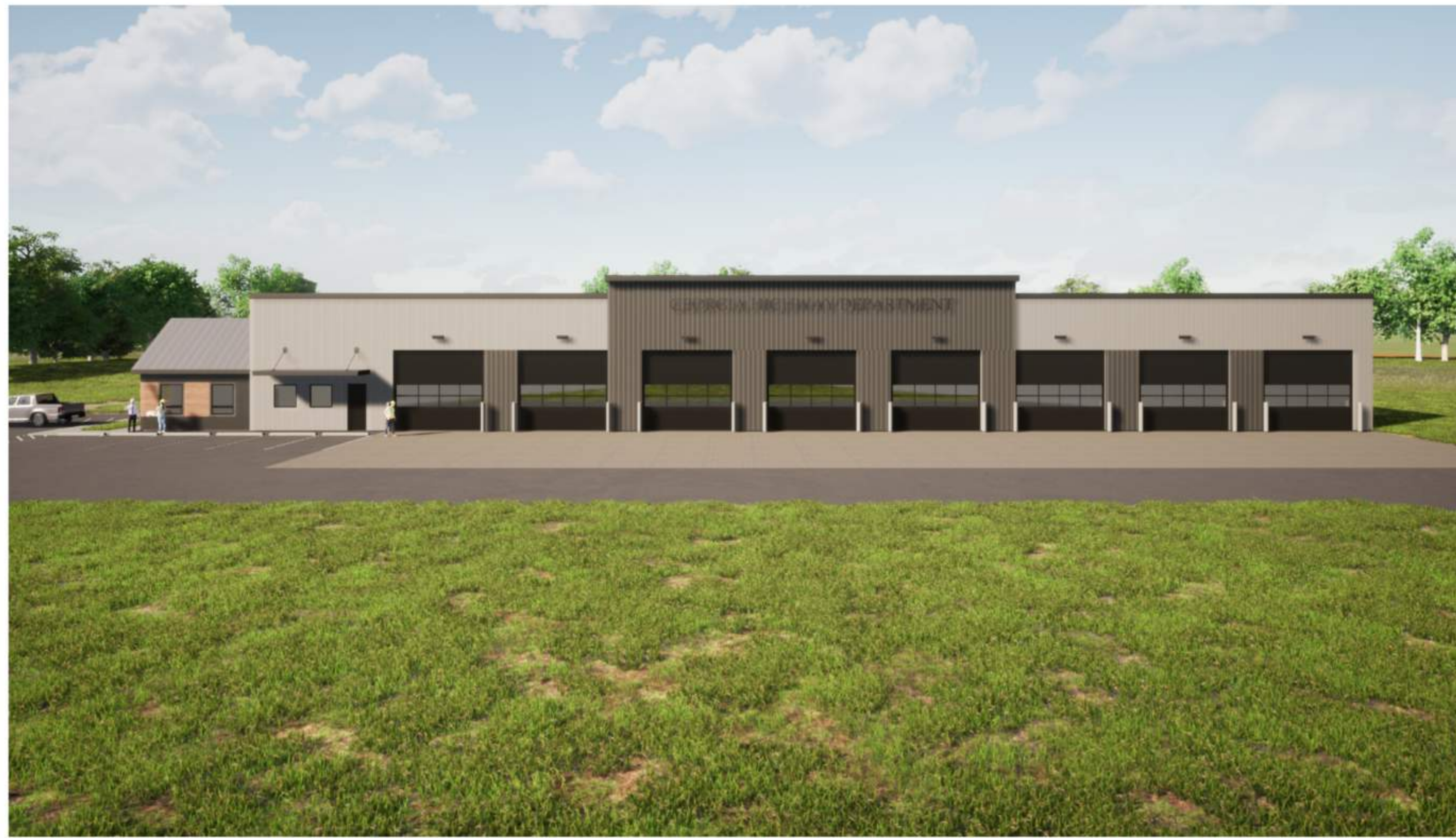
1: ELEVATION VIEW - WEST