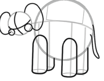
Add more basic shapes for the face