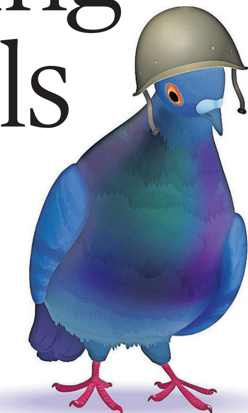
Cher Ami, a homing pigeon, saved 200 people during World War I.