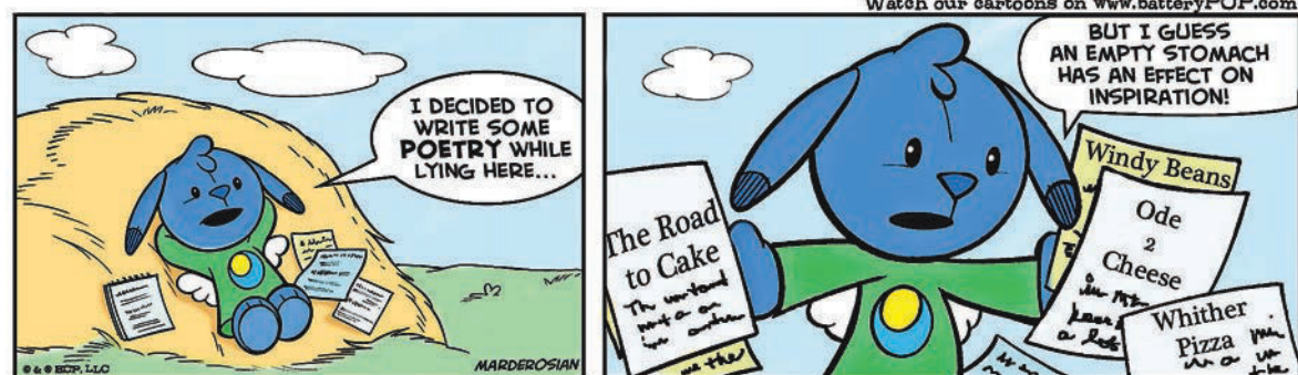
Watch our cartoons on www.batteryPOP.com