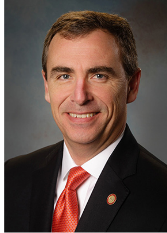
The Honorable Stephen C. Brich Commissioner VDOT