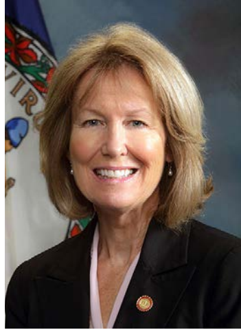
The Honorable Shannon Valentine Secretary of Transportation Commonwealth of Virginia