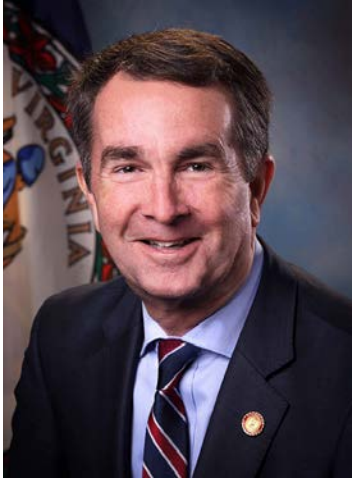
The Honorable Governor Ralph Northam Commonwealth of Virginia