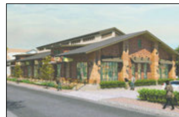
RENDERING COURTESY OF THE CITY OF REDLANDS

The multiple-tenant retail building at 333 Orange Street