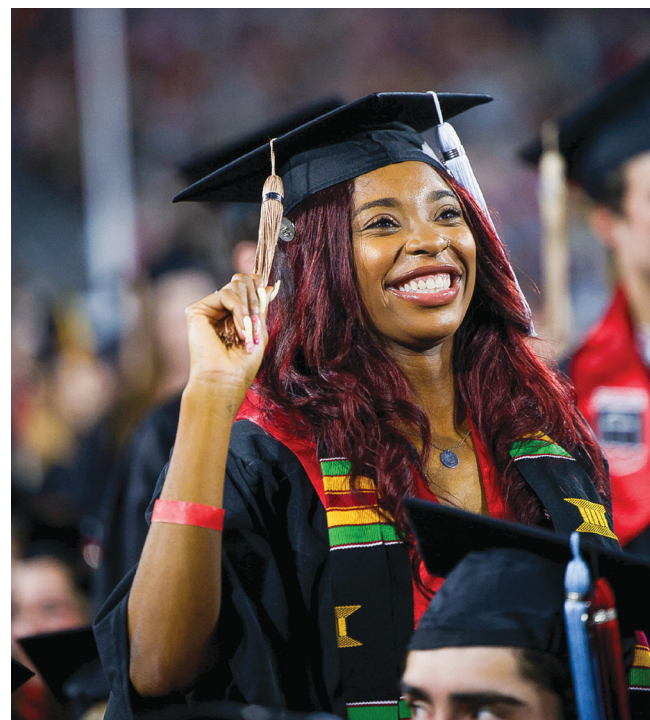
A student turns her tassel during the University of Georgia's Spring 2025 Commencement ceremony on Friday, May 9, 2025, at Sanford Stadium in Athens, Georgia.

The undergraduate ceremony will be broadcast live on YouTube on UGA's Commencement homepage.