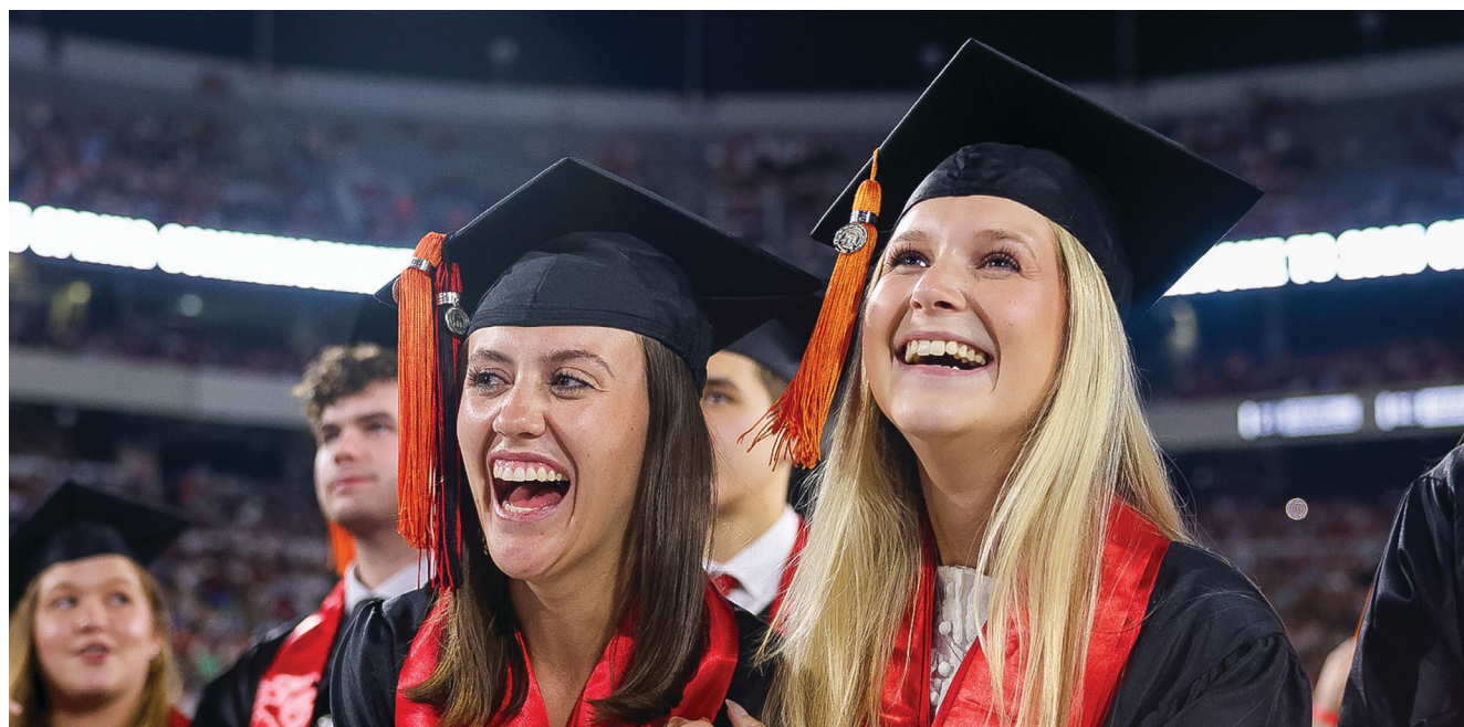
Two students celebrate during the University of Georgia's Spring 2025 Commencement ceremony on Friday, May 9, 2025, at Sanford Stadium in Athens, Georgia.