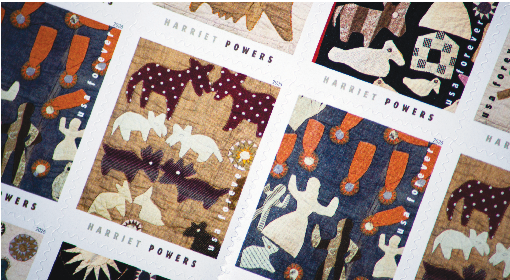
Stamps from the Forever stamps series honoring the late quiltmaker Harriet Powers sit in Athens, Georgia, on Monday, April 27, 2026.