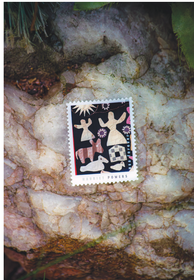
The United States Postal Service unveiled a new collection of postal stamps honoring the late Harriet Powers, who was an Athens folk artist renowned for her beautiful quilt depictions. The collection of stamps features the “Pictorial Quilt” and was released on February 28, 2026, as part of the Forever® stamps series.

“Fabric of a Nation: American Quilt Stories” was a 2021-2022 exhibition which marked the first time both masterpieces were brought together for public viewing. They are often kept out of public view in storage at their respective locations for proper preservation and protection from light damage.