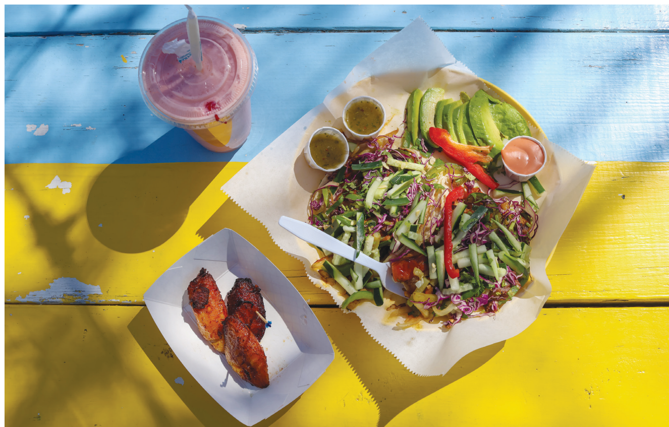
Veggie tacos and maduros from Cali N Tito's in Athens, Georgia, on Monday, March 11, 2024.

Graduation meals reflect how food brings people together to celebrate meaningful moments. In Athens, the range of dining options makes it easy for families and friends to gather, share a meal and mark the occasion. For many students, these are the same kinds of places that shaped their college experience, making the accomplishment feel that much more personal.