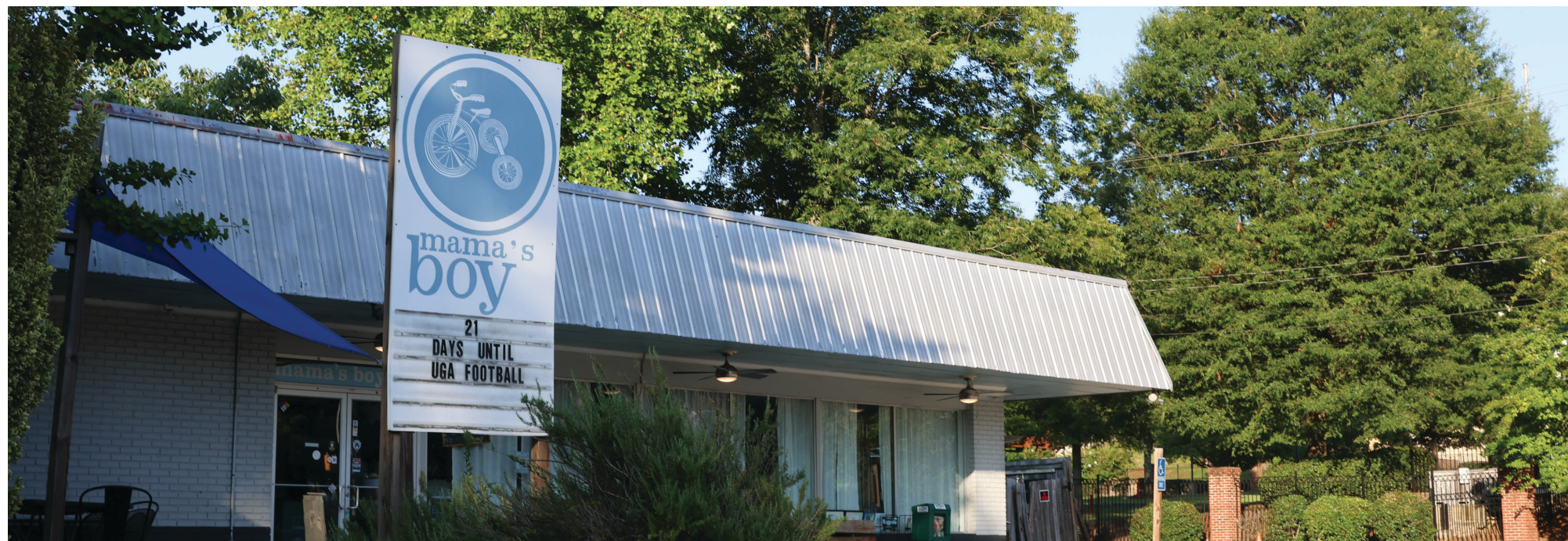
The Mama's Boy located on Oak Street is seen in Athens, Georgia, on Saturday, Aug. 10, 2024.

Visit redandblack.com for the English version of this article and for more Spanish translated journalism.