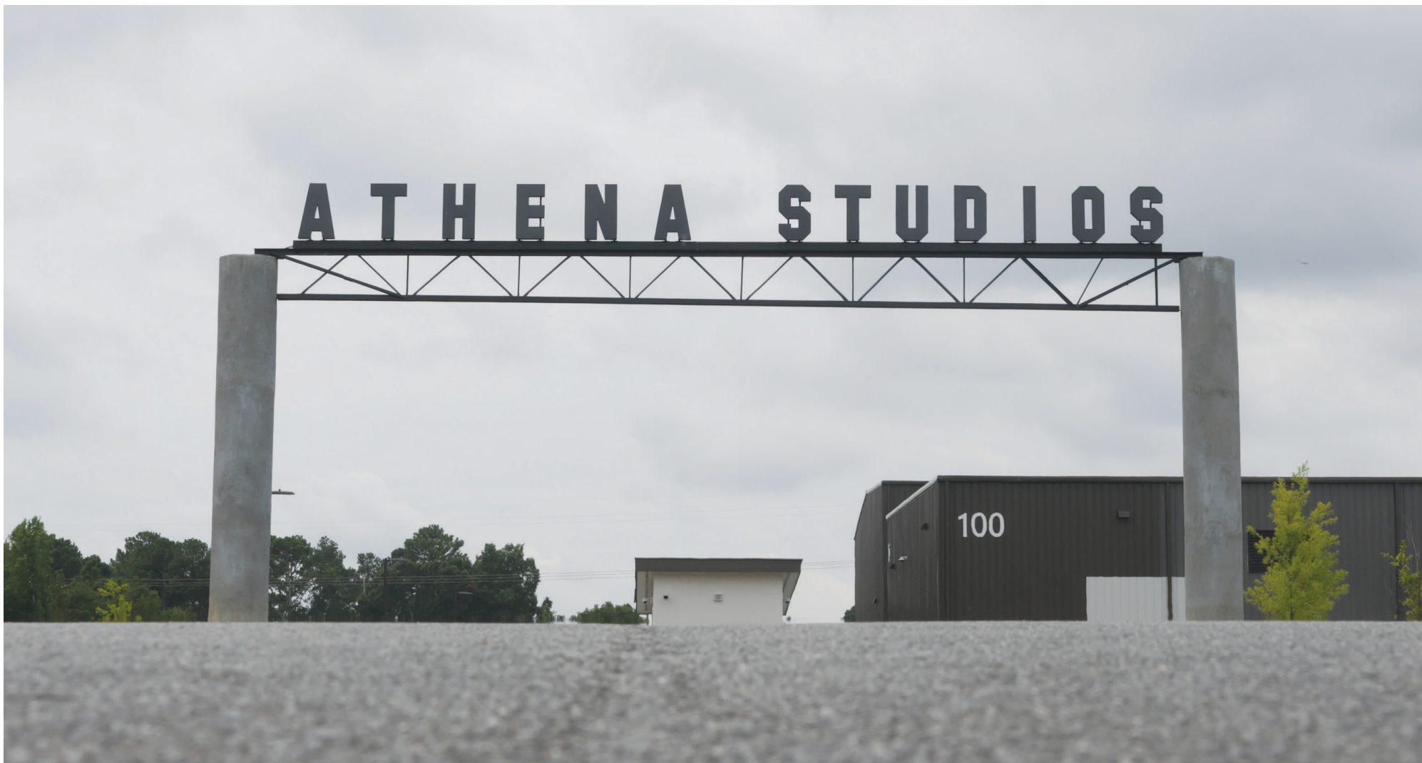
Athena Studios located off of Athena Drive in Athens, Georgia on Friday, July 19, 2024.