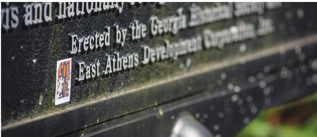
United States Postal Service stamps honoring Harriet Powers’ folk art quilts sit atop her grave in Gospel Pilgrim Cemetery in Athens, Georgia, on Monday, April 27, 2026. Powers was a renowned African-American woman and folk artist from Athens-Clarke County, known for her quilt-making skills.