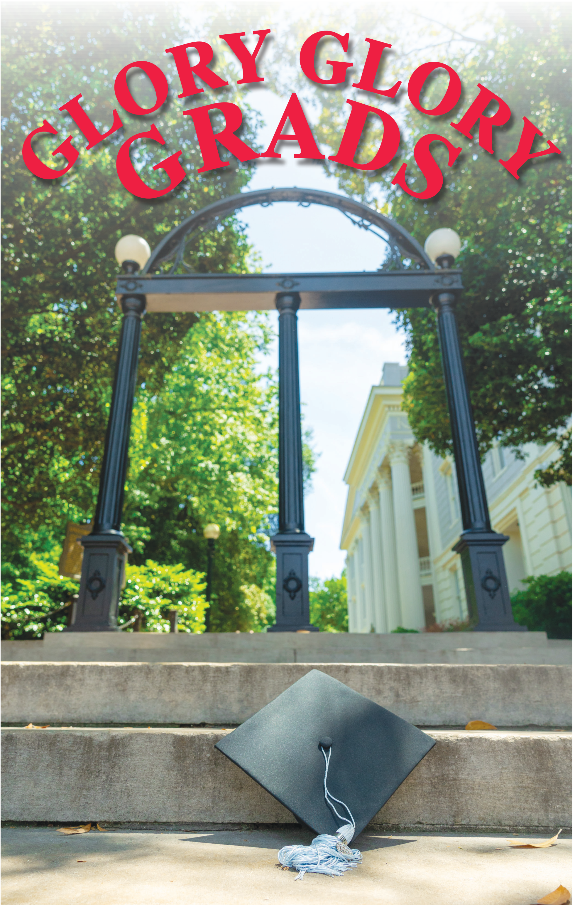
A graduation cap is laid on the ground in front of the Arch at the University of Georgia on Monday, May 4, 2026, in Athens, Georgia.