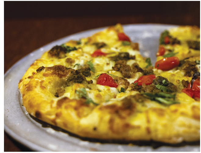
Pizza sits on a table at Pompeii in downtown Athens, Georgia, on Friday, April 24, 2026.