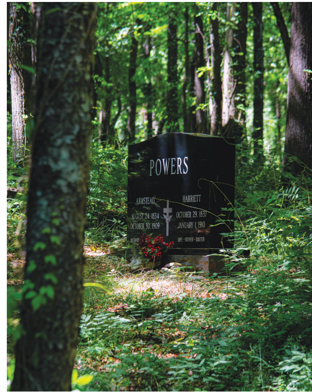
The headstone of the late quiltmaker Harriet Powers sits in Gospel Pilgrim Cemetery in Athens, Georgia, on Monday, April 27, 2026.