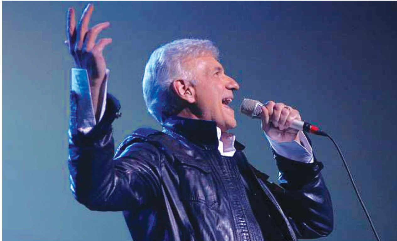
Former Styx lead singer Dennis DeYoung