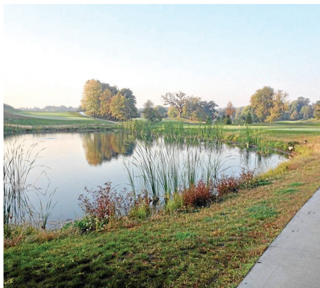
Palmer Hills Golf Course, Bettendorf, Iowa