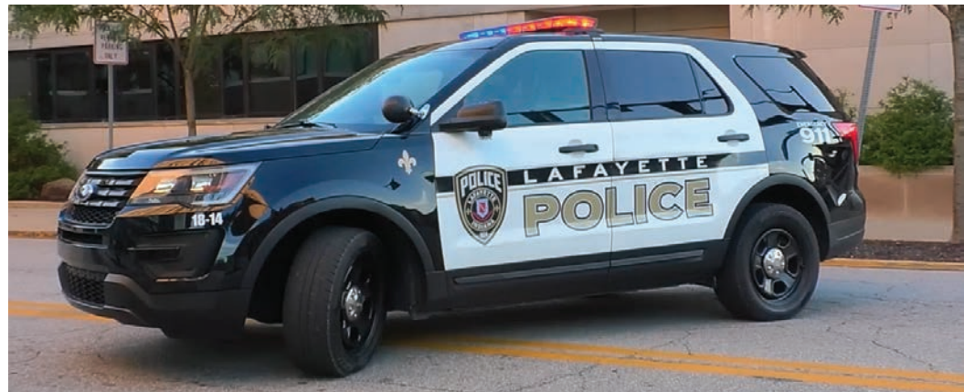
A Lafayette Police car sits in a parking lot.