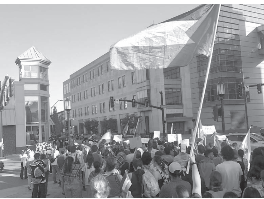
Protesters carry flags from Palestine and Lebanon as they wait to cross the road during an Oct. 11, 2024 protest.