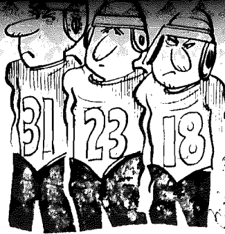
HAD DEODORANT FAILURE?