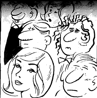
JUST DISSECTED A CAT?

The flag, now framed and under glass, is currently on display in the Alumni Association office, room 160 in the Memorial Union.