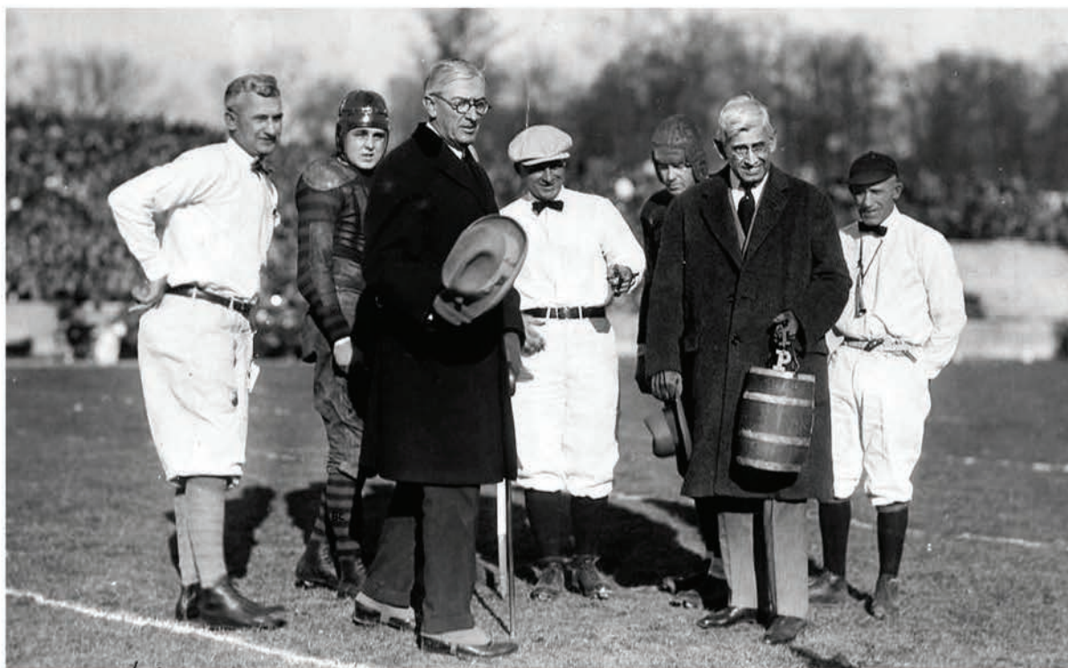
Members from IU and Purdue's football programs pose Nov. 21, 1925, with the Old Oaken Bucket trophy. The dedication of the brand new Tenth Street Stadium took place at 1 p.m. that day, and IU tied Purdue 0-0 in the football game.

Eventually, the duo came across Bruner farm where they