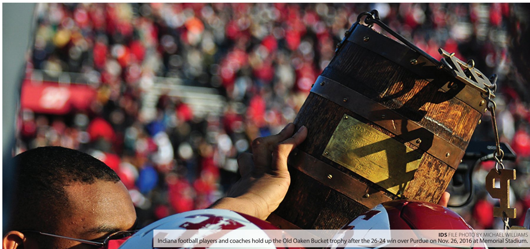
Indiana football players and coaches hold up the Old Oaken Bucket trophy after the 26-24 win over Purdue on Nov. 26, 2016 at Memorial Stadium.