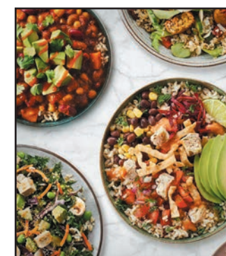
on their creativity with real ingredients.

Not only are the ingredients in every dish fresh, but the menu stays "fresh," too. Every 90 days, Freshii works to roll out new menu items, emphasizing