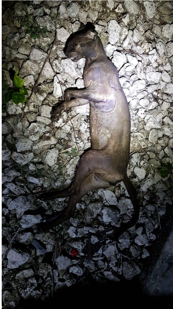
Electrocuted Cat found in GPA Tumon Substation 01 June 2019