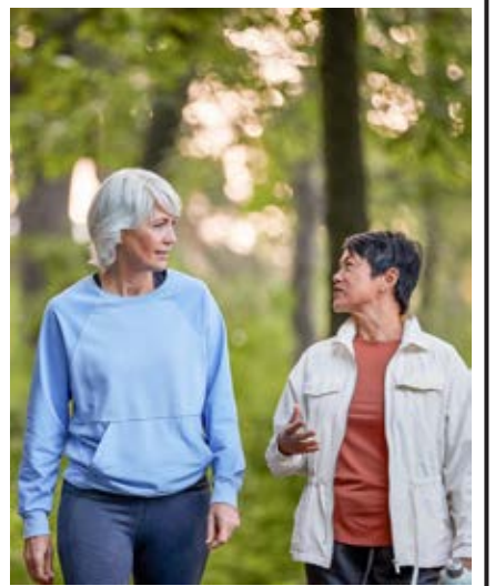
PRT-48731-A AECSPAD 25061579

We can help you secure a strong financial future. To learn more, get in touch with us today.