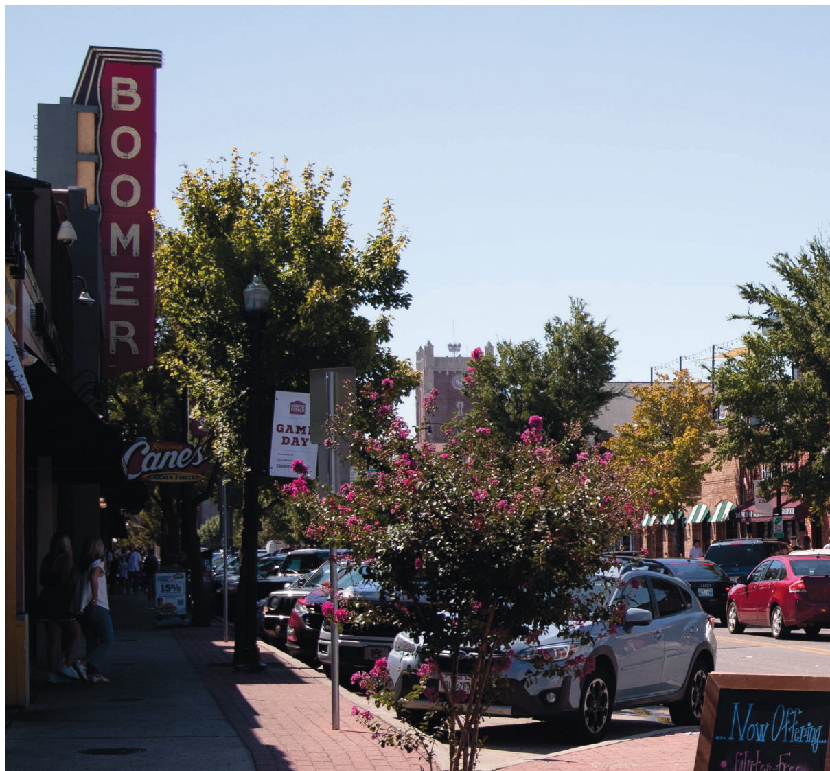
On football game days vendors and music crowd the streets of Campus Corner.

Yo Pablo Sports Bar and Grill: Open to people ages 21 and older, Yo Pablo Sports Bar and Grill offers live sports, food, drinks and a vibrant atmosphere. The bar has daily specials, including $2 select drinks and tacos on Tuesday; $5 burgers, quesadillas and draft pitchers of beer on Wednesday; and $4 well drinks and seltzers on Friday.