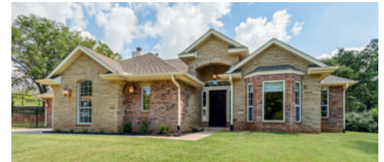
2351 E Lakewood DR Guthrie, OK 73044 4 Bed | 2.1 Bath | 2,294 Sqft | 5 acres $699,000