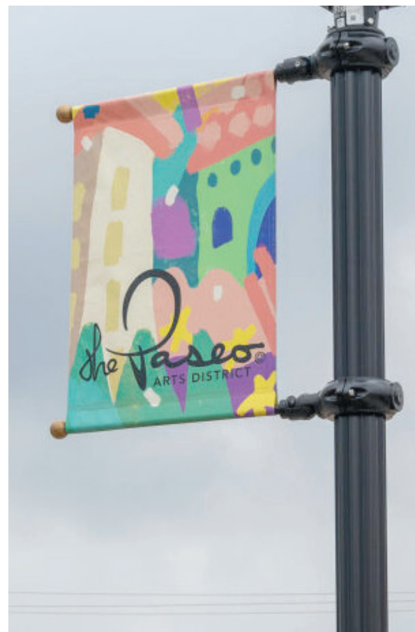
The Paseo district hosts an annual arts festival in May.

30th Street Market: 30th Street Market serves baked items, coffee, wine, beer and brunch food. The