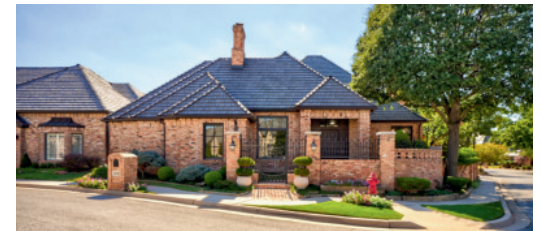
368 MILLBROOK DR NORMAN OK 73072 4 Bed | 3.1 Bath | 4,600 Sqft $865,000