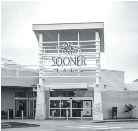
Sooner Mall is home to over 60 stores.

Regal Spotlight: One of two movie theaters in Norman, Regal Spotlight is a staple for residents to gather and enjoy films. The theater features reclining seats, many movie options and a concession stand with snacks, Pepsi products, sweets and slushies. Unique to Regal is its ScreenX option, a multi-projector experience that features 270-degree visuals for select movies.