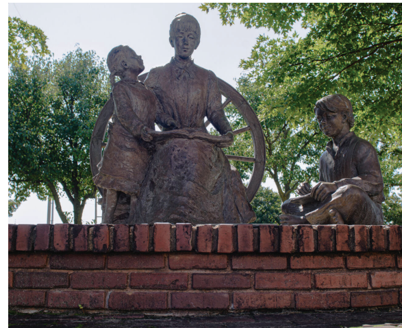
SHAYFER CANNON/OU DAILY

A Legacy Trail statue sits near the train tracks.