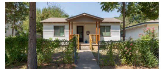
617 COMANCHE ST NORMAN, OK 73071 3 Bed | 1 Bath | 894 Sqft $179,900