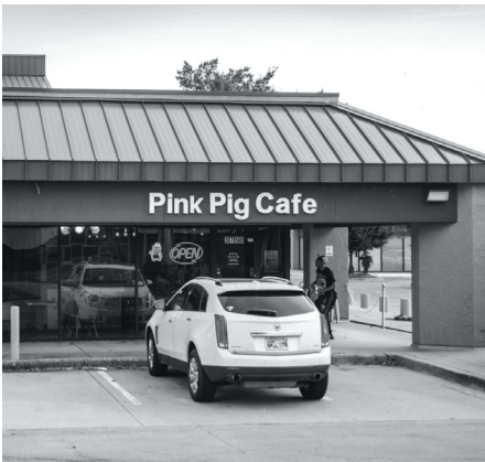
Pink Pig Cafe serves authentic Korean food.

Gaberino's Homestyle Italian restaurant offers seasonal menu items.