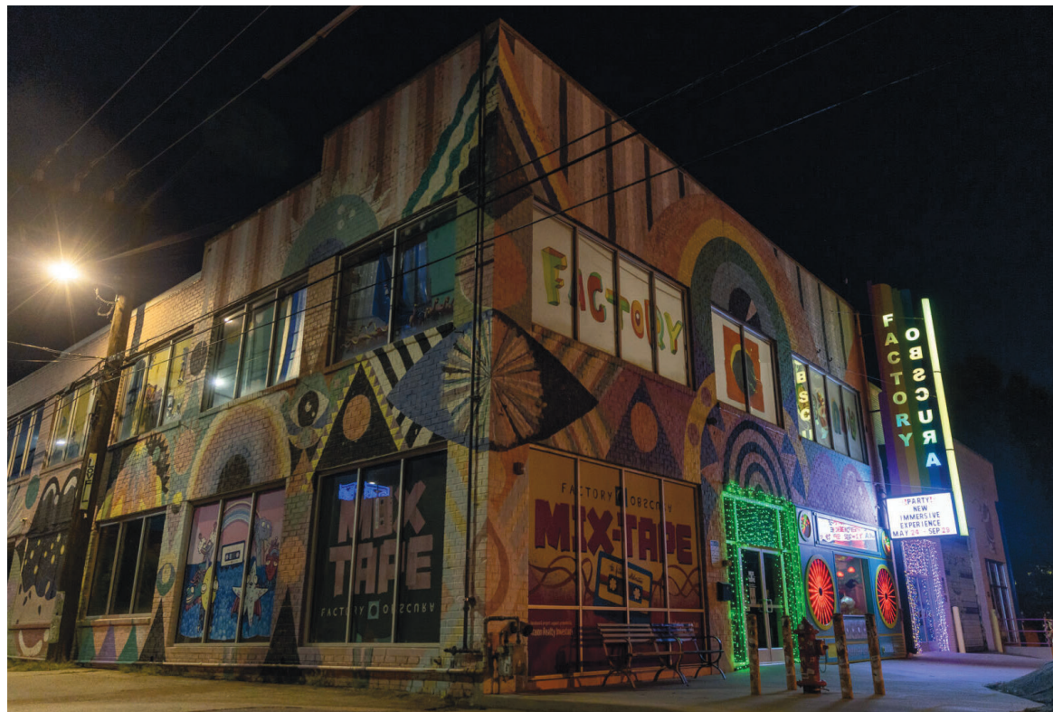
SUTTON SPINNER/OU DAILY

Plenty Mercantile: Plenty Mercantile, a mother-daughter owned gift shop, is dedicated to providing unique, eco-friendly and sustainable products. Ethically sourced and sustainable goods are often pricey and difficult to create, but Plenty has found a way to create them at a range of