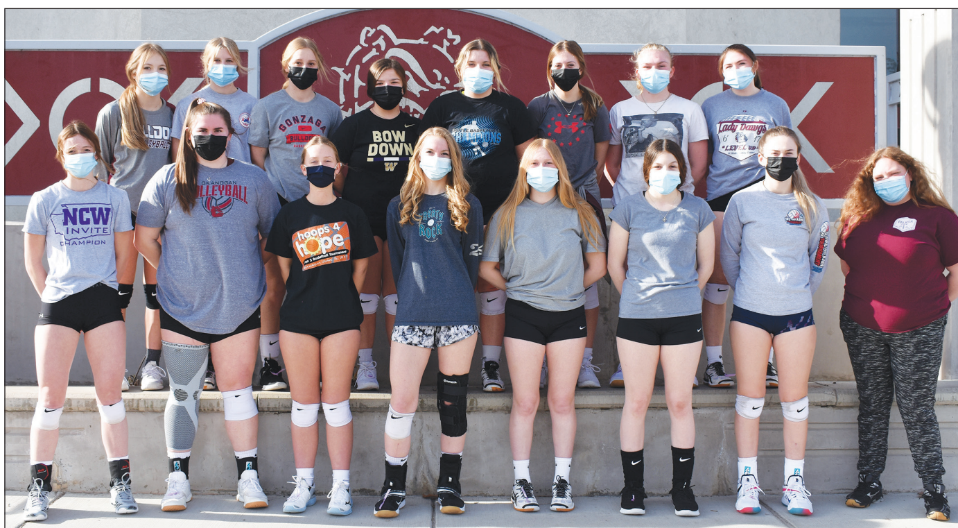
BROCK HIREN | The Chronicle