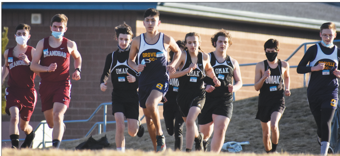
Varsity boys head out on the course during a high school cross country meet March 3 in Tonasket.