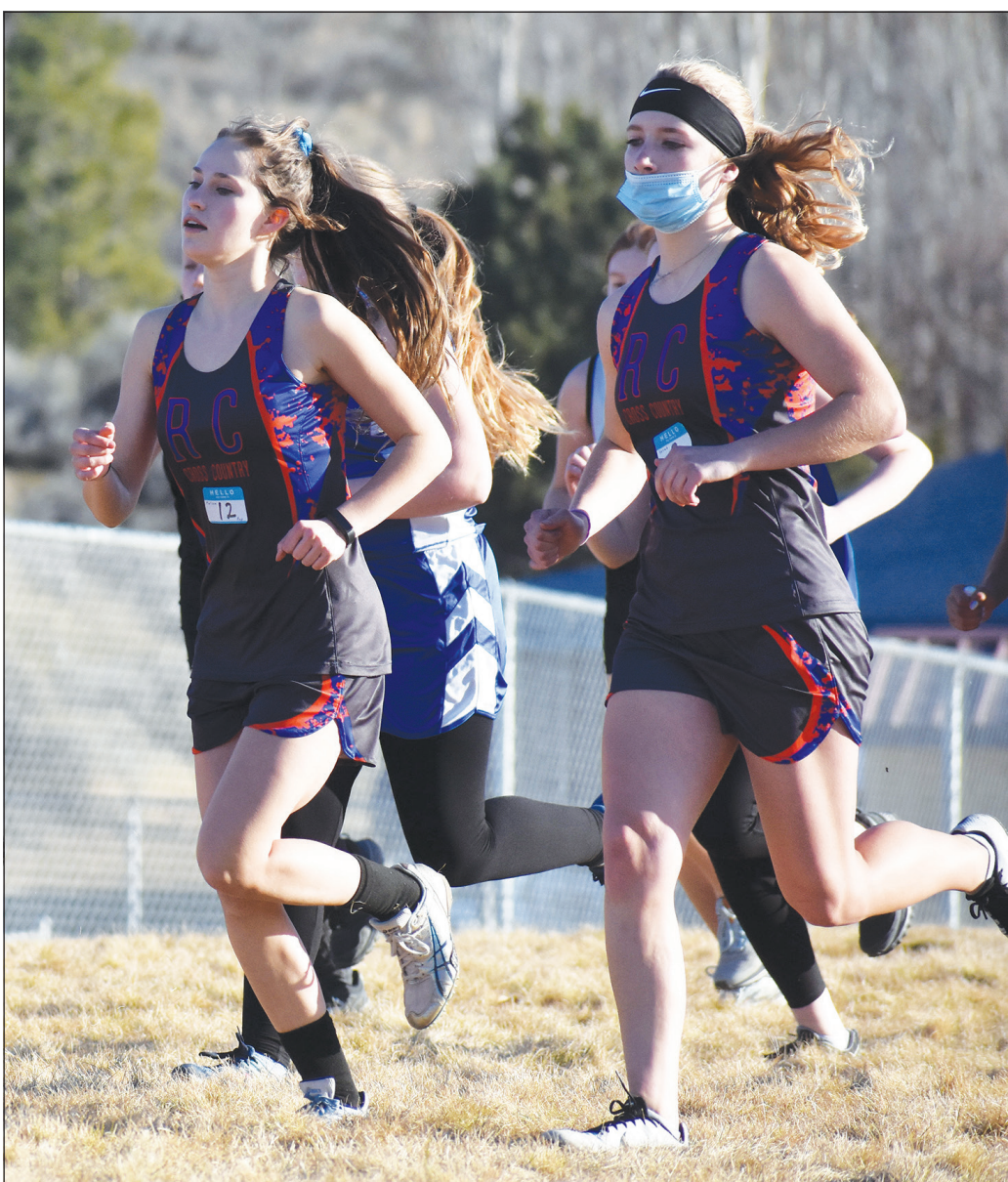
BROCK HIRES | The Chronicle Runners head out in the girls' varsity race at the Tonasket cross country meet March 3.