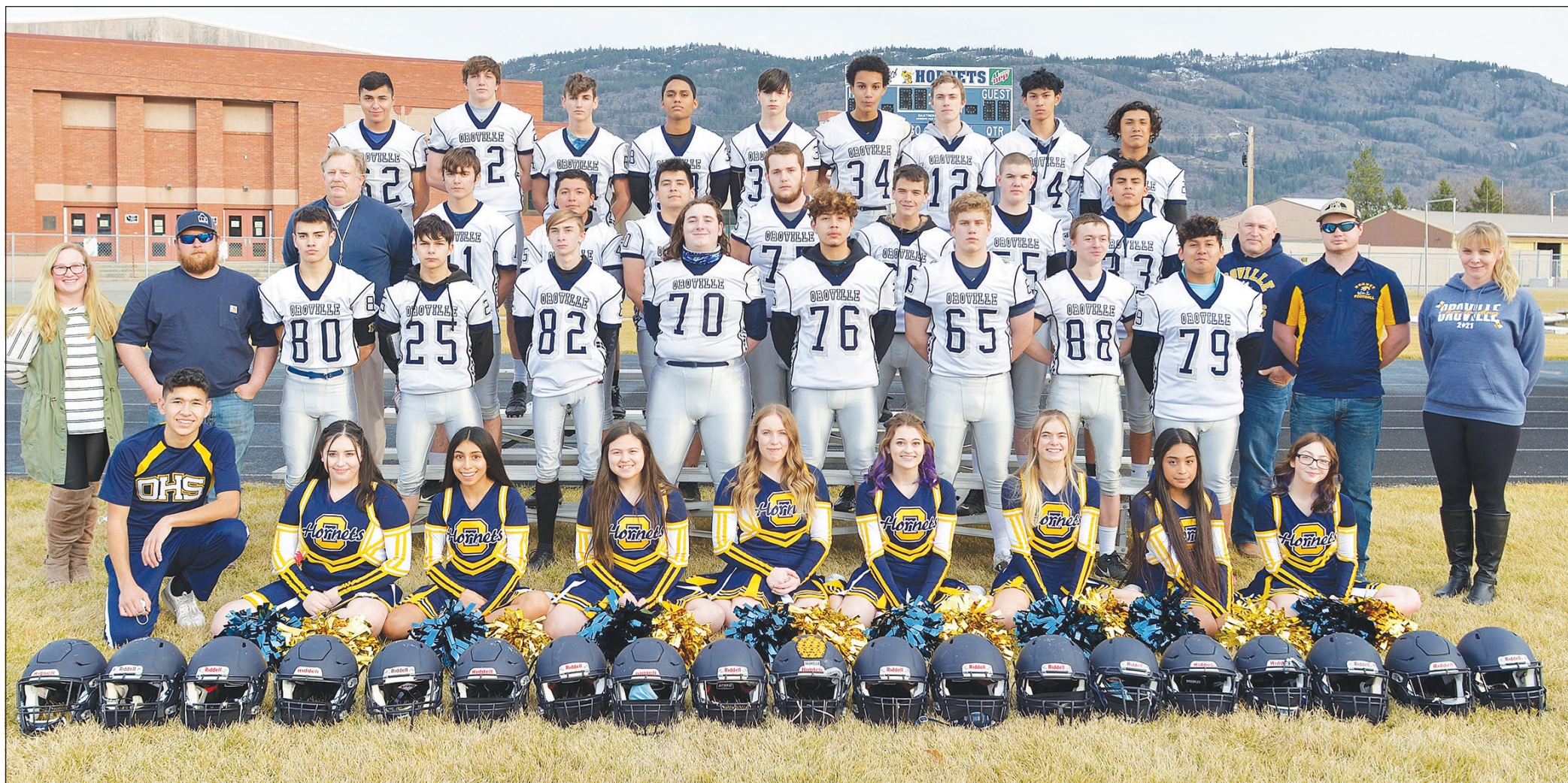
OROVILLE HIGH SCHOOL