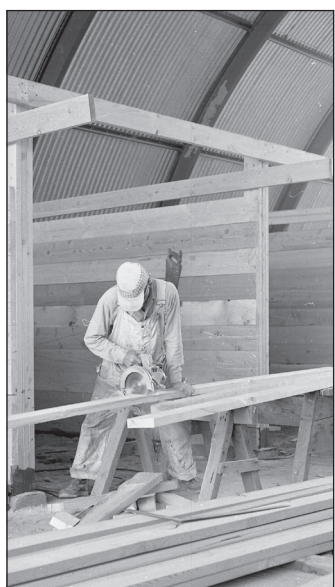
A volunteer cuts lumber to build an animal stall ahead of the 1964 fair.

Quality care for large & small animals since 1977. Serving the Greater Okanogan Valley and beyond!