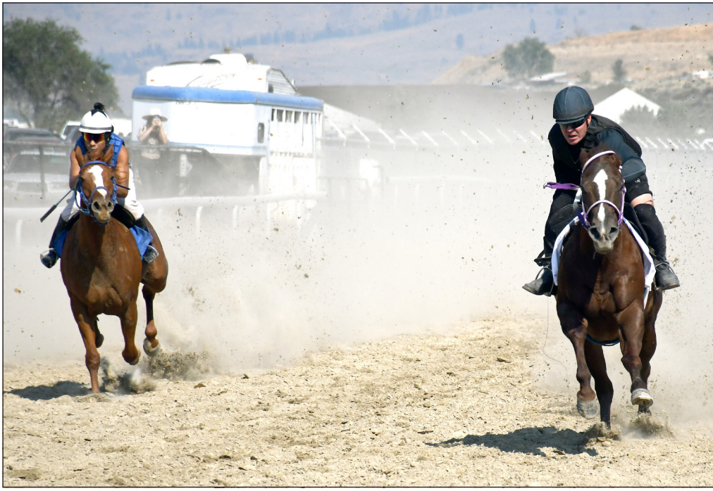
Horse races are back at the Okanogan County Fair this year with multiple teams and exciting competition set for Saturday and Sunday, Sept. 9-10.

Teams compete in large and small scale races, from pow-wows