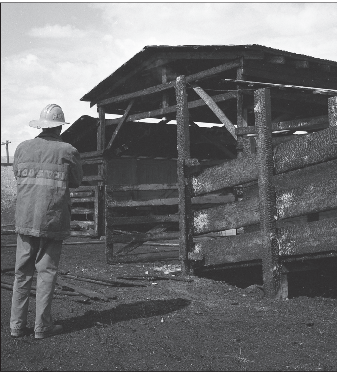
THE CHRONICLE A firefighter examines the damage to a livestock building destroyed by fire in 1963. A total of six buildings were lost in the blaze

In the late ‘80s, fairgrounds administration sought to increase usage of the grounds