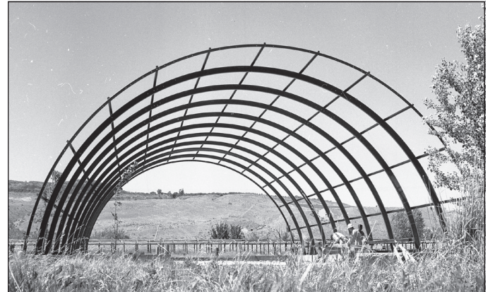
New Quonset huts are constructed in 1965.