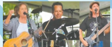
Raveling Toad Show

American Honey Small Town Strings feat. The Carlile Family Liberty Linklater Rabbits with Machine Guns Raveling Toad Show