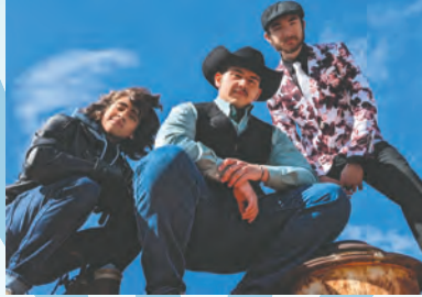
Rabbits With Machine Guns